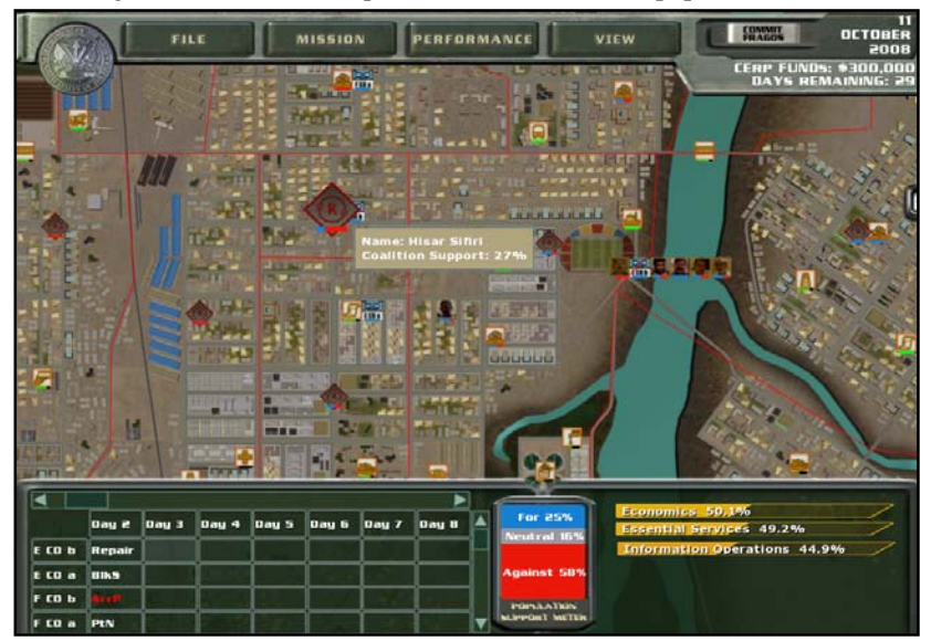
Figure 1. UrbanSim practice environment

The UrbanSim Practice Environment is unique in that it incorporates several AI technologies in order to support the training objectives of the application. The AI technologies that were selected each address specific challenges in simulating the complexities of urban environments and in guiding users in learning the skills of counterinsurgency operations. First, we utilized the PsychSim social simulation tool to model the goals, interrelationships, and beliefs of the population of the urban