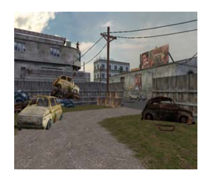
Figures 1, 2. Small City Scenarios.