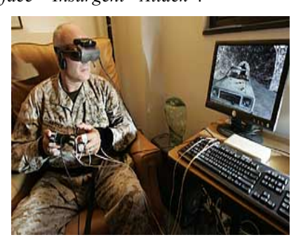
Figures 17, 18. Insurgent "Attack" ~ USA User Tests.