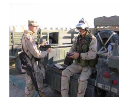
Figures 19, 20. User Tests – Iraq Combat Stress Control Team.