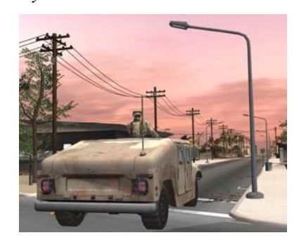
Figures 3, 4. Large City Scenarios.