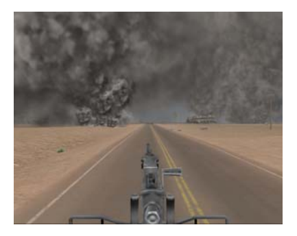
Figures 11, 12. "Flocking" Patrol ~ Turret View.