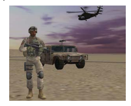
Figures 5, 6. Desert Outskirts.