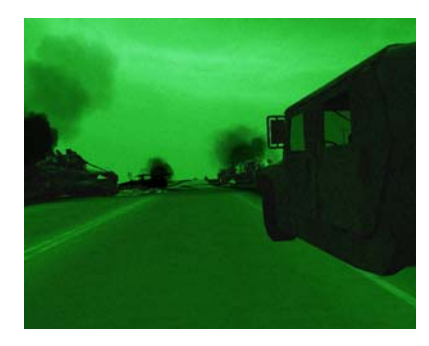
Figures 13, 14. Helicopter View ~ Night Vision View.