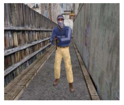
Figures 15, 16. Clinical Interface ~ Insurgent "Attack".