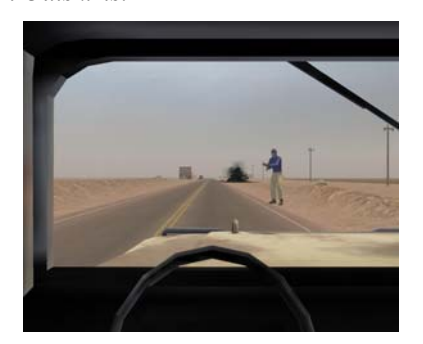
Figures 7, 8. Desert Roads.