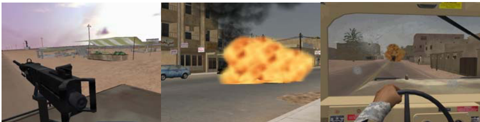
Figures 4-6. Turret View in Desert Road Scenario and IED Attacks

User-centered design feedback needed to iteratively evolve the system was gathered from returning Iraq War veterans in the USA and from a system deployed in Iraq and