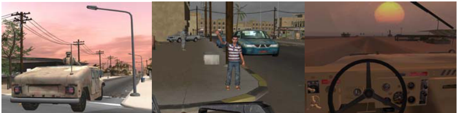
Figures 1-3. Virtual Iraq City and Desert Road Scenes