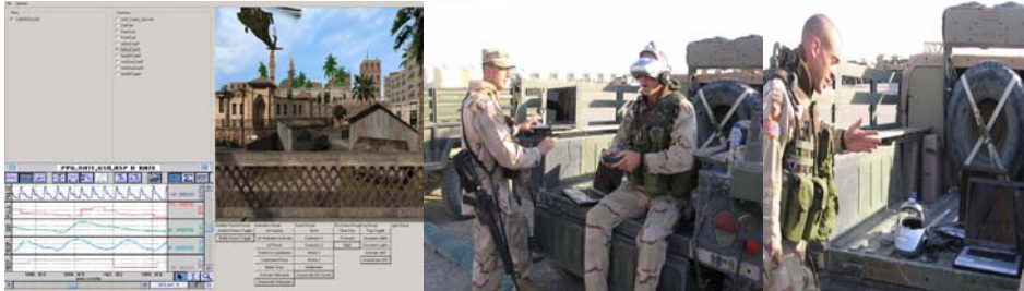
Figures 7-8. “Wizard of Oz” Clinical Interface and User feedback from Iraq

tested by an Army Combat Stress Control Team (Figure 8). Clinical trials are currently underway at Ft. Lewis, Camp Pendleton, Emory University, Weill Cornell Medical College, Walter Reed Army Medical Center, San Diego Naval Medical Center and 12 other sites. The standard clinical protocol being tested involves 10 treatment sessions conducted on a twice weekly basis. A full description of the application and treatment protocol can be found in [7].