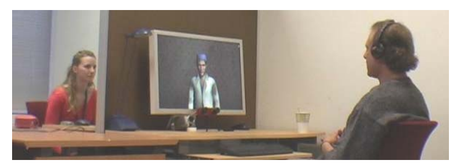
Figure 2: Experimental setup

The subjects were randomly assigned to one of two conditions labeled respectively "responsive" and "unresponsive". In a responsive condition the Avatar was controlled by the RAPPORT AGENT, as described earlier. The Avatar therefore displayed a range of nonverbal behaviors intended to provide positive feedback to the speaker and to create an impression of active listening.