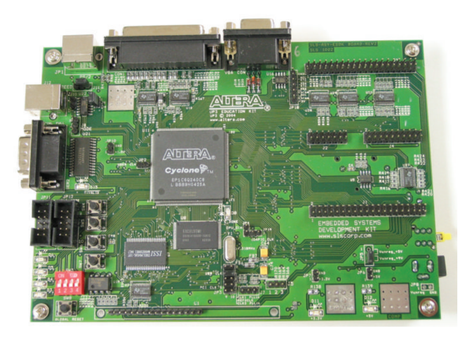
FIGURE P-1 Altera's UP3 development board.

newer board from Altera is called the DE2 board (see Figure P-2), which has a powerful new 672-pin Cyclone II FPGA and a number of basic features such as switches, LEDs, and displays as well as many additional features for more advanced projects. More development boards are entering the market every year, and many are becoming very affordable. These boards, along with powerful educational software, offer an excellent way to teach and demonstrate the practical implementation of the concepts presented in this text.