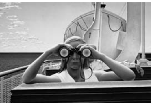
Alex Colville (1920–), To Prince Edward Island , 1965, acrylic emulsion on masonite, 61.9 \times 92.5 cm. National Gallery of Canada, Ottawa, © NGC/MBAC.

Yet men do not usually define the troubles