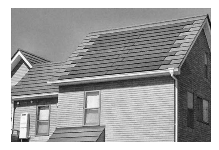
Figure 22.32 Prefabricated Japanese tilelike roof panel method with CdTe cells in Nie-ken (JA). Capacity of the system is 1.3 kWp.