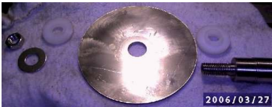
End plate components laid out separate, prior to assembly. End plate, washers/insulator, nut, center rod.