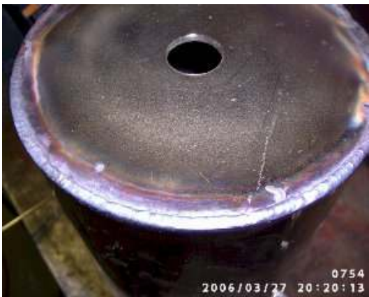
End plate welded to outer cylinder.