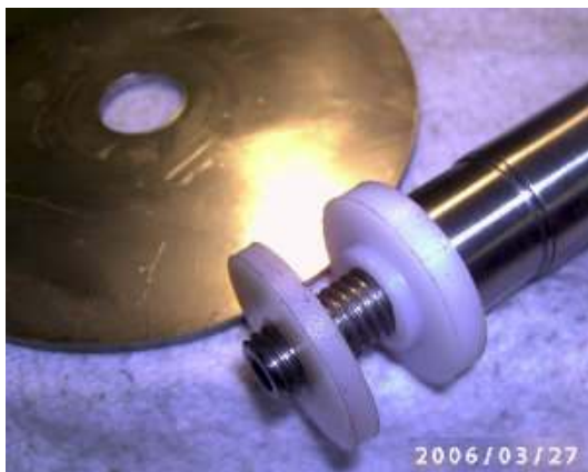
Metal center rod with white washer spacers/insulators position illustrated, minus the end plate, which is laying to the left.