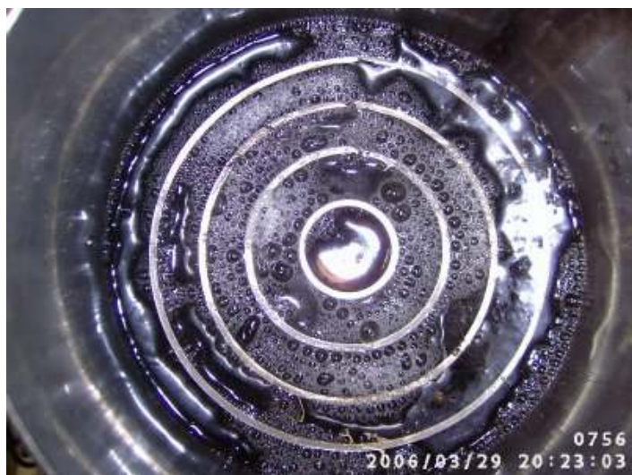
Assembled cell, bubbling.