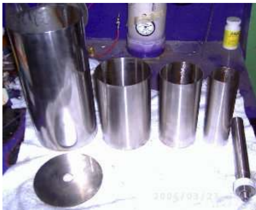
Cylinders set out individually, with center rod and end plate laying flat on table.