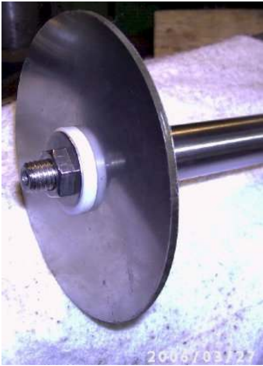
End plate fastened on with nut, with washer spacers/insulators.