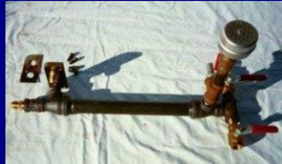
(6) Finished Reactor

Step 6 - Assemble the sub-assemblies onto the reaction chamber above making sure to install the 12" rod inside pointed away from the engine. Now it's time to start on the bubbler.