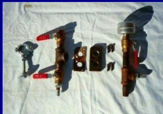
(5) Valve Components

Some "Briggs and Stratton" engines, etc usually already have the exhaust threaded for 1/2" pipe, but the intake is on the other side of the engine causing longer hose runs. Also a compression pipe connector or a piece of rubber hose with clamps will need to be connected from the engine intake to the Bubbler pipe.