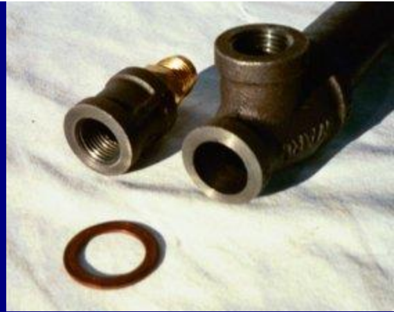
(3) Tee & Connector

The 1/2" pipe connector and 1/2" tee will each need to have one end smoothed off as well to receive the copper washers as a tight seal. If anyone has a machine shop that would like to do this for others, contact GEET. We might also offer a complete kit that has all the parts ready to be assembled in minutes if there's enough interest.