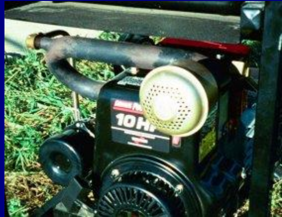
(12) 5 kW GEET Generator

Step 12 - For an installation on a generator, you can also use 90 degree elbows to keep the pipes within the cage. Mount the GEET Fuel Processor as far away as possible from the generator magnetic field so they do not interfere with each other. Also be very careful with credit cards in your pockets or video cameras, etc from getting too close to the engine while it's running so they won't be erased.