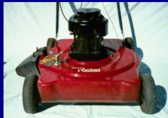
(2) Stripped Engine

Step 2 - Strip down the engine removing the gas tank, muffler, and carburetor. Remove the mower blade and replace with a 12" diameter steel disk flywheel of the same thickness as the blade for safety.