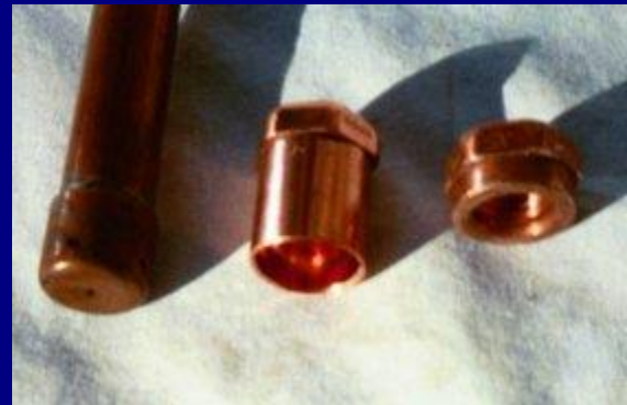
(7) Bubbler End & Pipe Nut

Step 7 - Take 10 3/4" x 1/2" copper pipe and solder a copper 1/4" NPT - 1/2" pipe adaptor on one end and a 1/2" cap on the other. Drill a 1/16" hole through the cap, turn 90 degrees and drill through again, also one up through the bottom. Take the other 1/4" NPT - 1/2" adaptor and cut off the thinwall portion to make a pipe nut and file smooth for inside the Anti-Freeze jug.