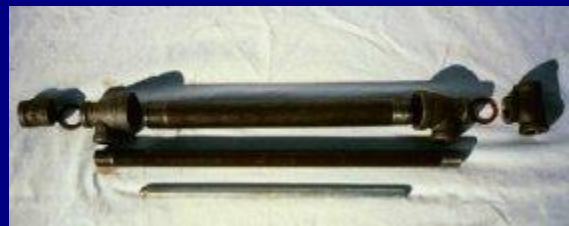
(4) Plumbing Pipes & Rod

Step 4 - Have a plumber or plumbing center cut your inner reactor 1/2" pipe to 16 + 7/16" and thread both ends. Use Black Pipe here because galvanized pipe gives off toxic fumes if heated too much. File the 12" x 1/2" multi-fuel steel rod to a bullet point on one end only. (7 + 3/8" x 1/2" for gasoline only) This will keep you out of trouble later if you can't remember which way the rod points. The engine will not run if the rod is put in backwards after it has a magnetic signature.