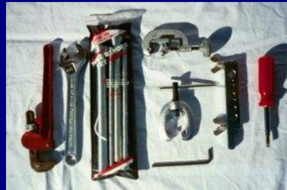
(1) Tools Needed

Most professional plumbing supply stores stock higher quality parts compared to large home centers cheap plumbing parts. The savings aren't that much on a small project like this. The most crucial quality part is on the inner pipe, problems arise from inconsistent wall thickness, out of roundness, thick weld seams, etc on low quality pipe.