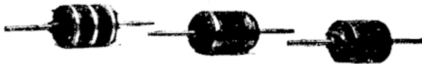
Three rotors used with the early induction motor shown below

When I was a boy of seven or eight I read a novel untitled "Abafi"—The Son of Aba—a Servian translation from the Hungarian of Josika, a writer of renown. The lessons it teaches are much like those of "Ben Hur," and in this respect it might be viewed as