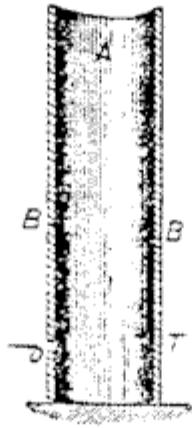
DIAGRAM b . OBTAINING ENERGY FROM THE AMBIENT MEDIUM

A , medium with little energy; B, B , ambient medium with much energy; O , path of the energy.