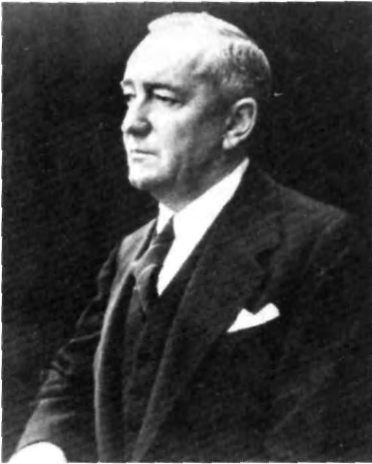
One of the few existing photographs of William Stephenson.

had been assigned a dual mission: first, a traditional intelligence function, to keep an eye on German intelligence operations in the United States; second, he was to work as a covert action specialist with the objective of getting the United States into the war by any means, fair or foul. It was to this second mission that Stephenson was to devote most of his time and energy.