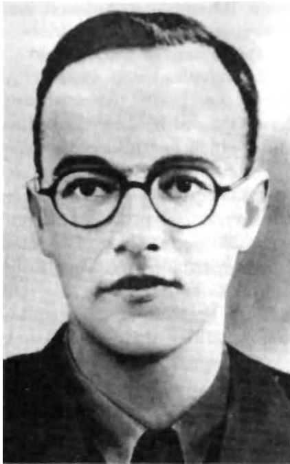
Klaus Fuchs, the German emigre nuclear physicist who betrayed the secrets of the atomic bomb to the Russians.