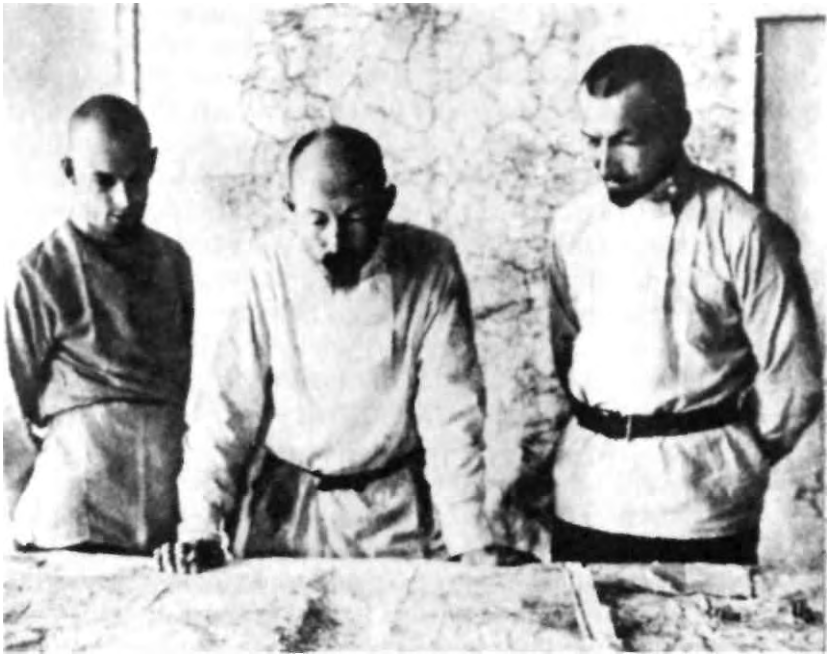
Feliks Dzerzhinsky (center) strategizing over a map during the October Revolution.

He moved with decisive swiftness. He had all the Okhrana officers he could find rounded up and offered a role with the Bolsheviks, under pain of death or imprisonment. From the Bolshevik power base in St. Petersburg, he seized all communications, including the post, telegraph, telephone, and even messengers. All "non-Bolsheviks" were banned from using any of these communications, so when Lenin carried out his coup, many members of the Kerensky administration did not know what was happening until it was too late. The communications blackout also served to paralyze Lenin's other opponents; by the time they tried to mobilize a counter coup, the Bolsheviks already had seized the reins of power.