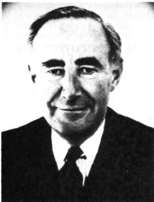
MI5 Director Roger Hollis, whose handling of Soviet defector Igor Gouzenko caused mole-hunters in British intelligence to suspect him of being a KGB mole.

overseas assignment, in June, 1943, following espionage schooling in Moscow. He had been a young army soldier in 1941, working in radio communications, when his brilliant abilities in handling cipher work brought him to the attention of GRU recruiters.