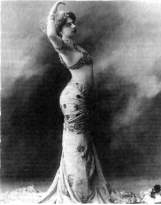
Margareta Zelle, in costume as the "Eye of Dawn" (Mata Hari).

spy; she remains the one instantly recognizable name in the public's mind when the subject turns to spies.