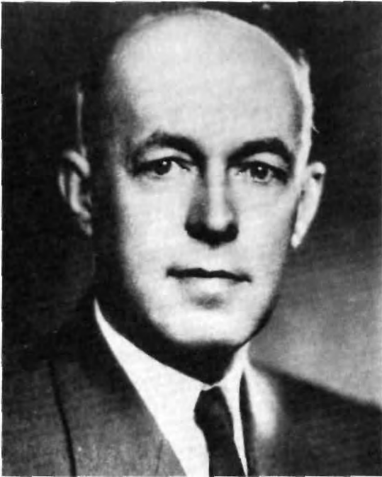
Herbert Yardley, the legendary American codebreaker whose Black Chamber was to dramatically affect the course of World War II in the Pacific.

in use, the more he was convinced that they were so simple as to make them useless for modern coded communications. Rebuffed by his superiors when he complained about the codes, Yardley decided on direct action to make his point: over a period of several months, he solved every single American code then in existence, and wrote up a report entitled Exposition on the Solution of American Diplomatic Codes . He concluded that European nations, known to have a first-class cryptographic ability, undoubtedly were reading the simple American codes with ease. He impolitically presented this report to his superior, who just happened to be the man who devised the codes in the first place. To further make his point, Yardley coolly walked into the man's office and opened his safe—whose combination, Yardley figured out, was based on the telephone number of President Woodrow Wilson's fiancée.