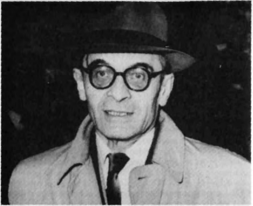
Rudolph Roessler (LUCY) arrives at a Swiss court in 1953 for his trial on espionage charges.

wasn't. It is this ambiguity that forms the core of the Roessler legend.