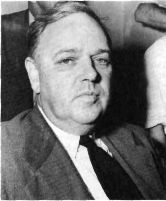
Whittaker Chambers, who set off the most explosive spy case in American history.

The FBI was puzzled by Chambers' reluctance to name names. Since he admitted to serving as a courier for Soviet rings operating inside the U.S. government, and thus obviously knew the identities of those assets, the FBI suspected he was protecting a close friend.