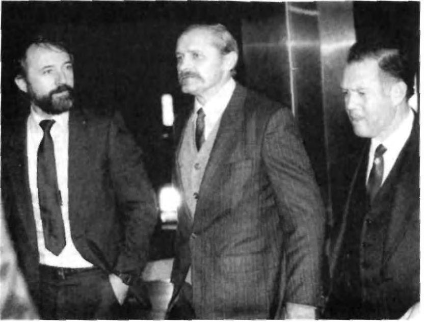
Vitaly Yurchenko, one of the KGB's brightest stars, entering the U.S. State Department after he defected to the U.S. for love of a woman.

agencies. In 1968, he expanded into foreign intelligence operations, and was assigned to Alexandria, Egypt, under cover of Soviet naval adviser to the Egyptian navy; his real job was to collect intelligence on the American Navy and other Western navies in the Mediterranean.