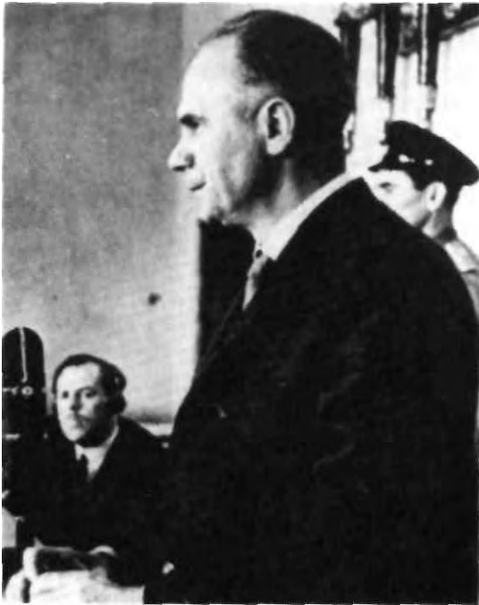
Colonel Oleg Penkovsky during his 1963 trial in Moscow on espionage charges after he was caught passing intelligence to the CIA and MI6.

Born 1919 in the Caucasus, the son of a mining engineer, Penkovsky entered the Red Army in 1939, and as a Communist party member with a clean record, was made a commissar. He fought in the Russo-Finnish war of 1940, then served during World War II in the artillery branch, suffering a severe wound in June 1944. Two years later, Penkovsky, regarded as one of the army's brighter officers, was recruited for the GRU. By 1955, he was the GRU's resident in Ankara, Turkey, under cover as military attache.