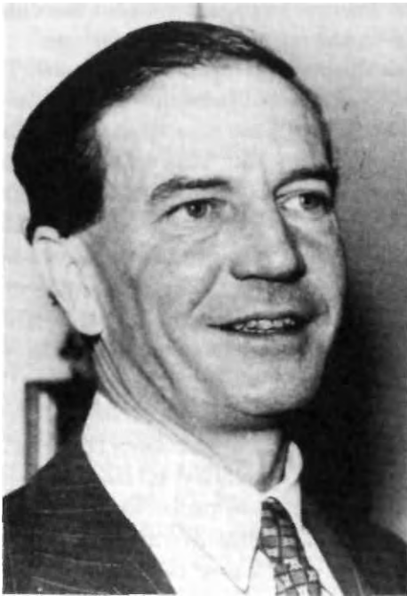
The quintessential mole: H. A. R. (Kim) Philby in 1955, when he was already under suspicion as a KGB agent who had infiltrated British intelligence.

a curious figure in British history, the Arabist H. St. John Philby. A full-blown eccentric, Philby senior made his name in the Middle East, where he worked on behalf of British intelligence to stir up Arab revolution against Turkey. After the war, convinced that Britain had betrayed the Arabs, he moved to Saudi Arabia, where he became a Moslem, took an Arabian woman as his second wife, and warned his son never to trust the word of the British establishment.