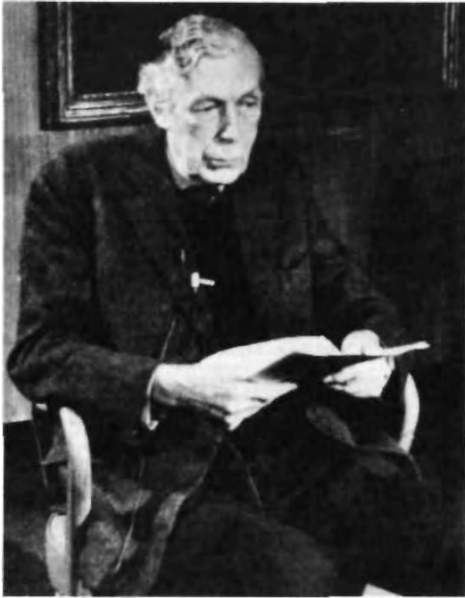
Anthony Blunt, a prominent art historian and art adviser to the Queen, in 1979 after his role as a Soviet spy was publicly revealed.

than Blunt could have imagined. There was an ugly edge to Blunt's role as a talent spotter: he often used sexual blackmail to keep new recruits in line, threatening to expose their homosexuality. In the days when homosexuality was a serious crime in Britain, this was no idle threat.