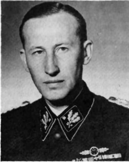
The sinister Reinhard Heydrich, called by Hitler "the man with an iron heart."

was organized—or, for that matter, did he know anything about intelligence. Nevertheless, drawing on his memories of spy movies and novels, he quickly sketched out how he thought a modern intelligence service ought to be organized. Himmler, who didn't know anything about intelligence either, was impressed; on the spot, he appointed Heydrich head of the new service, which he called the Sicherheitsdienst (SD).