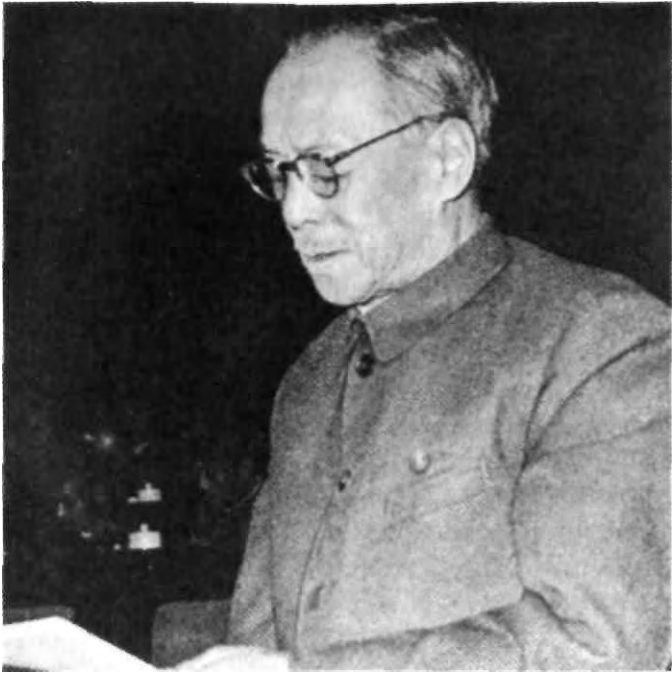
K'ang Sheng, Communist China's spymaster.

he came to the attention of party leaders by demonstrating a flair for espionage. He organized an informal spying operation to ferret out police spies from the party, an operation he extended to include spying on "dissidents" in the party who failed to demonstrate sufficient zeal in toeing the latest party line.