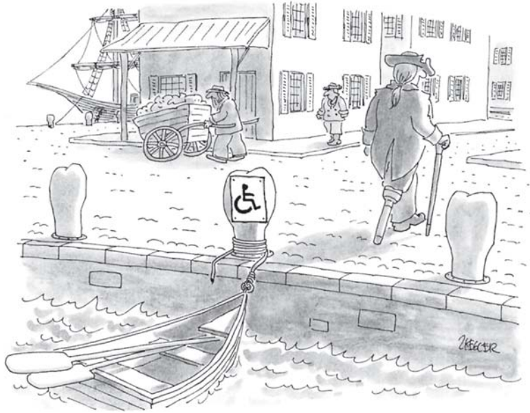
Figure 3. Peg-legged parking. (© The New Yorker Collection 1997 Jack Ziegler from cartoonbank.com. All rights reserved.)

Of course, would-be helpers must be taught how . . . They must also be dissuaded tactfully when their efforts are worthless. . . . The pedagogical role required can wear thin. (104–5)