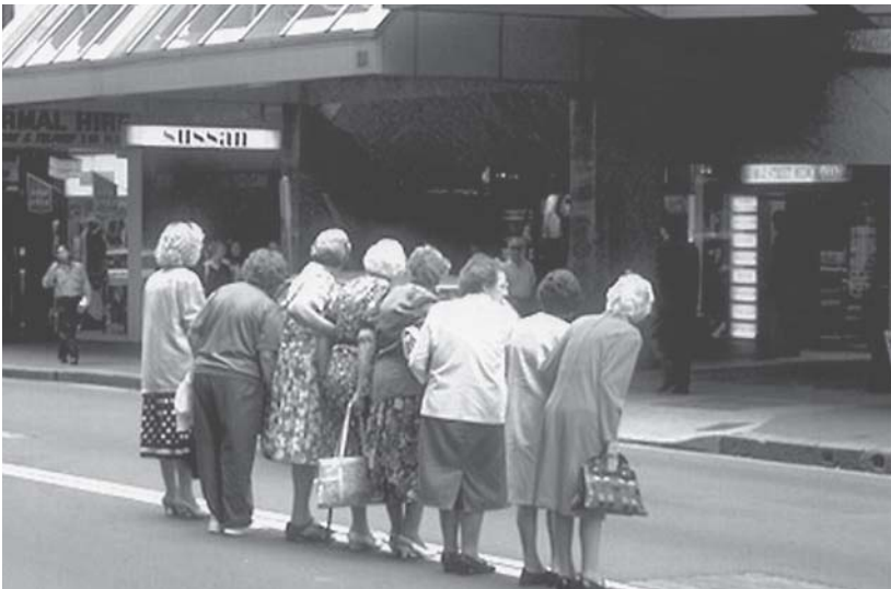
Plate 3. Linking arms and hoping for safety in numbers offer scant protection against anxiety, fears, or cars when people walk slowly.