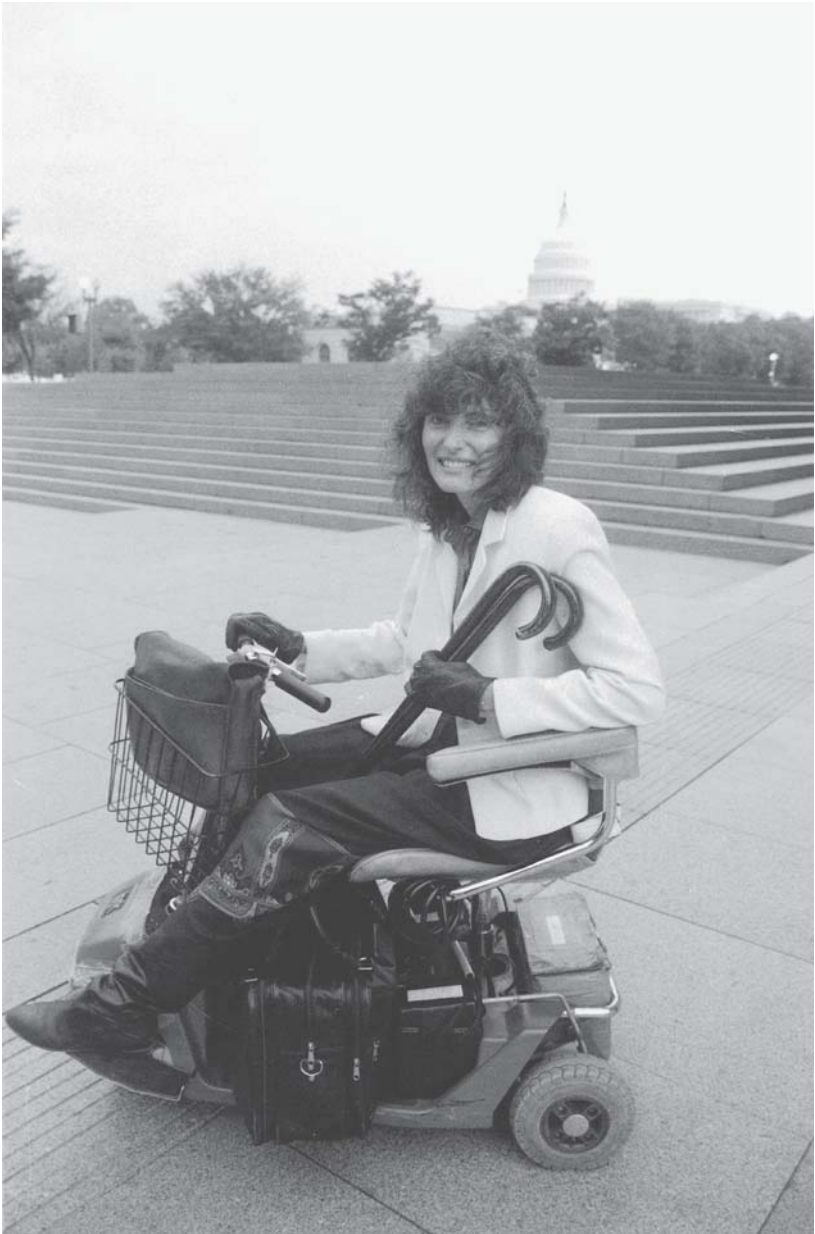
Plate 1. I got from Boston to the Capitol by wheelchair-accessible taxi, airplane, and Washington's subway, the Metro. I have canes for walking and a suitcase rides below my legs.