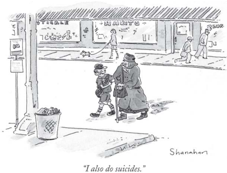
Figure 5. The ultimate Boy Scout.

going to feel that I'm talking down to them.' " Strangers need instruction. As one wheelchair user said, "People are very decent, really want to help. But very few of them know what to do, and so they have to be guided. It's very rare that I get a door deliberately slammed in my face. People do not see me—it's not ill will."