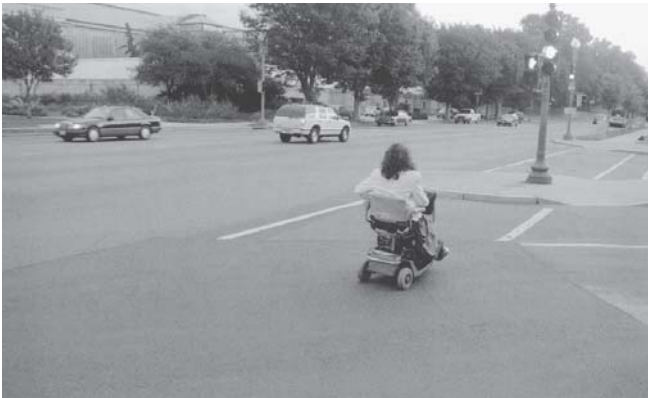
Plate 8. Waiting at a corner with curb cuts but without clearly marked crosswalks, I hope—as always—that my scooter won't fail and that the drivers will see me as I pass their way. Nonetheless it feels terrific to be on wheels, powered by batteries, after having had so much trouble walking. I often feel I'm grinning like a fool as I buzz along.