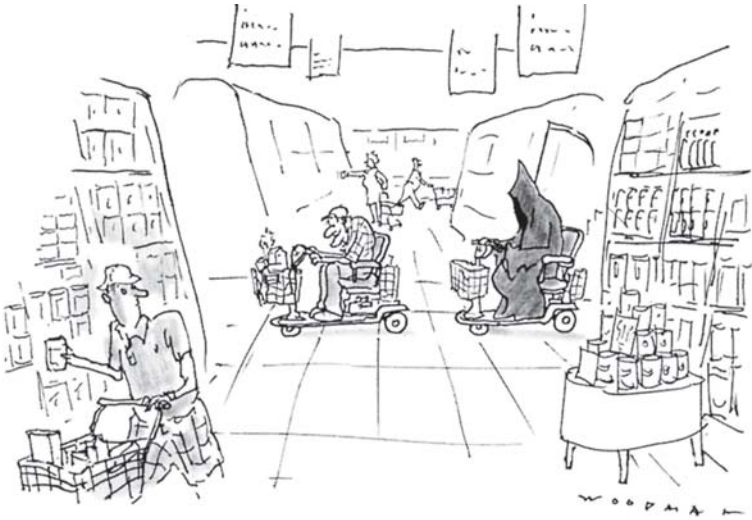
Figure 4. The phantom shopper. (© The New Yorker Collection 1997 Bill Woodman from cartoonbank.com. All rights reserved.)

race or ethnicity can further complicate views about disability; therefore in this chapter I indicate interviewees' race or ethnicity. Researchers typically try to find overarching themes tying such comments together, but here I could not—numerous threads emerged. They do fall broadly into two camps, good and not-so-good. The same interviewee could suddenly turn 180 degrees, one minute lauding the consideration of strangers, the next decrying their insensitivity. "Good" experiences can have troubling subtexts and vice versa. These contradictions probably reflect reality.