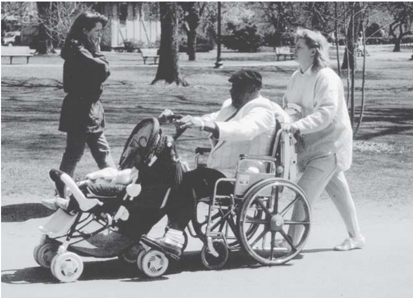
Plate 6. One woman moves all three people. The man's wheelchair appears heavy, institutional, hard to self-propel, with no seat cushion or back support to maximize safety and comfort.