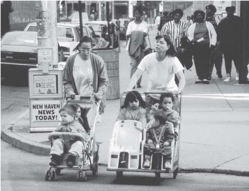
Plate 5. Curb cuts make it easier for everybody to get around.