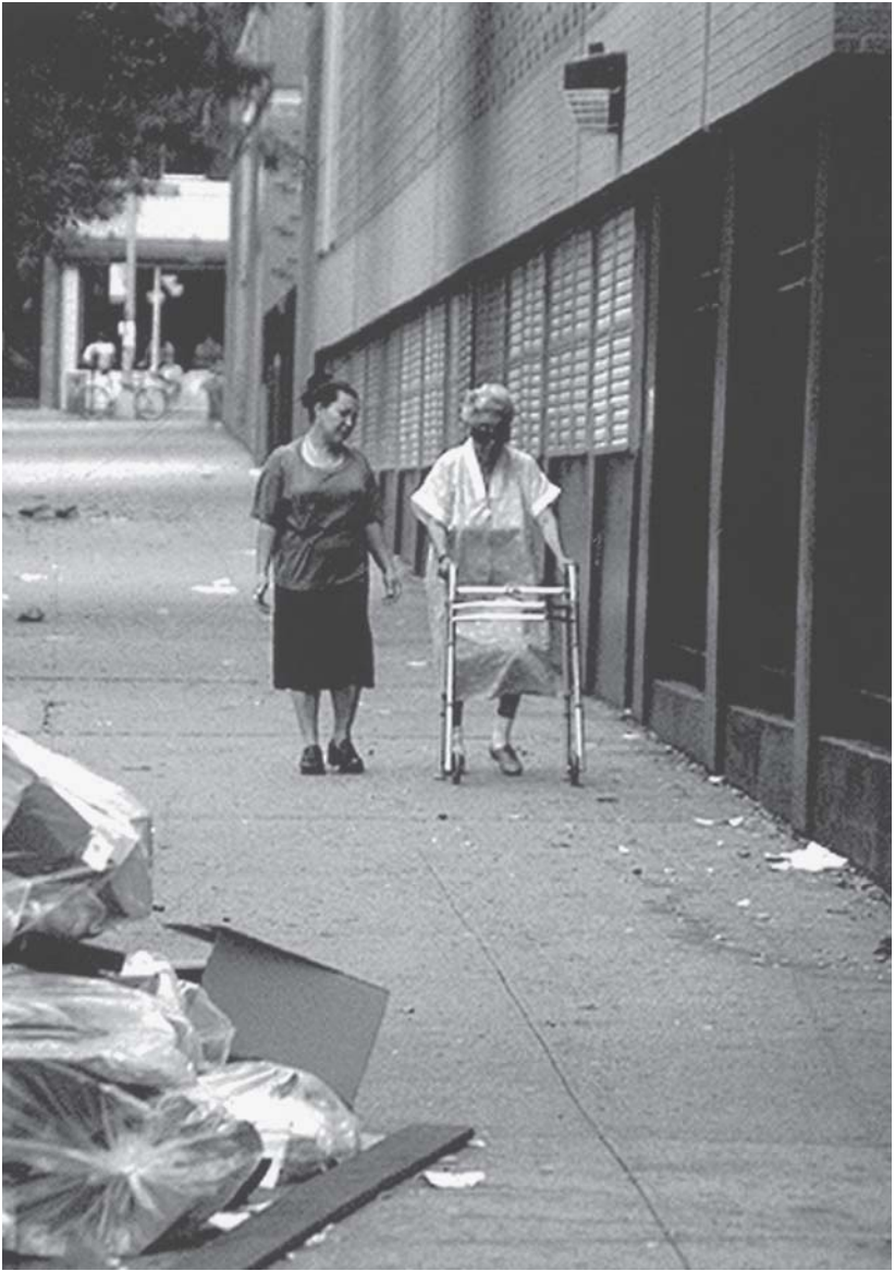
Plate 4. About one quarter of the people with major walking difficulties live in poverty. Trash-strewn or poorly maintained walkways, physical isolation, fears of injury or violence present other barriers. Many people with mobility problems live alone and cannot easily find walking partners.