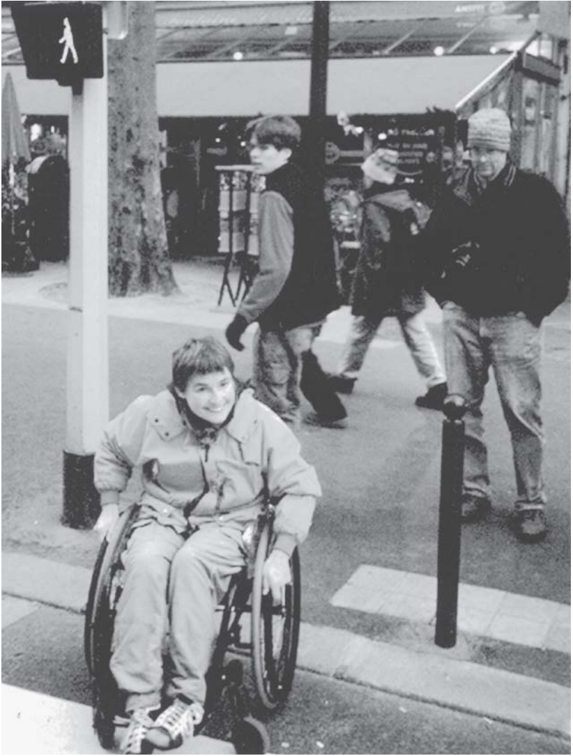
Plate 7. This woman in a lightweight rigid-frame wheelchair has the upper body strength to self-propel; she also has curb cuts. Even so, she moves below the gaze of most walkers.