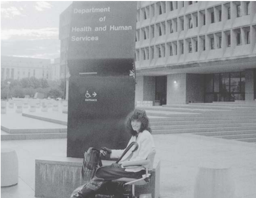
Plate 2. Barriers surround me: zigzagging stairs and concrete blocks. The wheelchair-accessible route into the U.S. Department of Health and Human Services building (which the sign points out) leads to a side entrance.