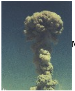
MET - Military Effect Test (37 K)

What are Those Smoke Trails Doing in That Test Picture?