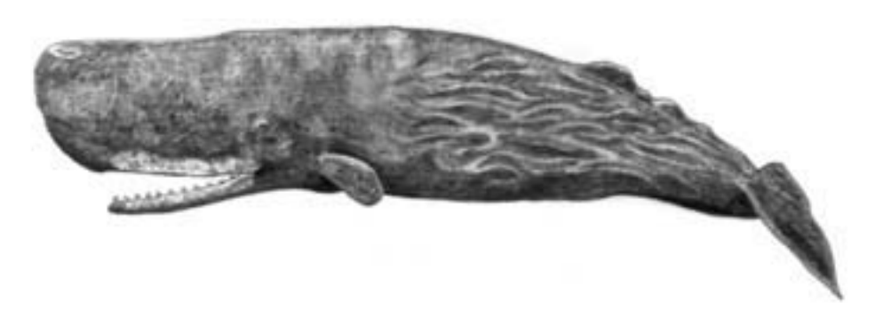
"Sperm Whale, Physeter macrocephalus ," 1984. Donald A. Sineti (b. 1943). Reprinted with permission.