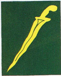
HQ Malaya Command