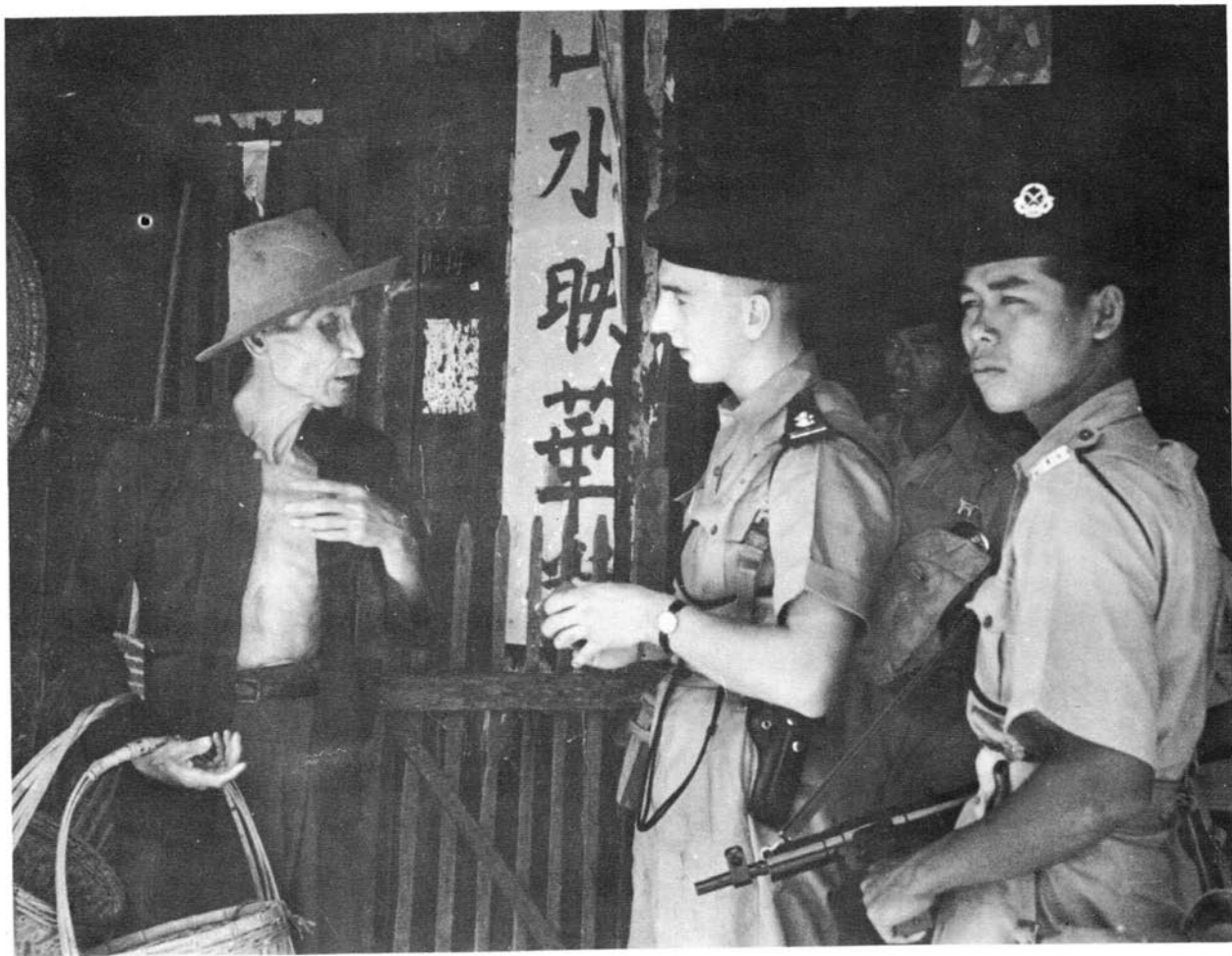
European lieutenant of Federation Special Police and Malay constables check the identity card of a Chinese vegetable grower, 1949.

Gurney, former Chief Secretary in Palestine, was installed as High Commissioner of Malaya on 6 October, and implemented some harsh measures to counter the desperate situation. People suspected of aiding the enemy were interned or deported to China in large numbers. Under Emergency Regulation 17D, made effective on 10 January 1949, inhabitants of entire villages could be detained at the High Commissioner's discretion. By October 1949 this regulation had been invoked 16 times and 6,343 people had been placed in detention camps; 10,300 Chinese had by then been deported.