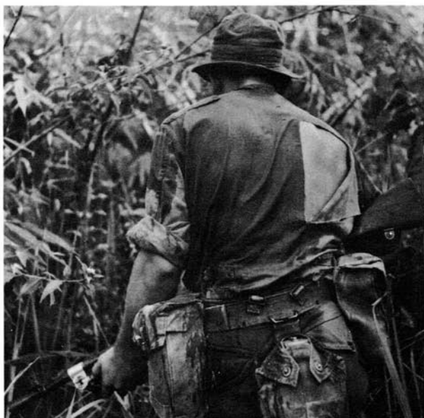
Bren gunner of 1st Royal West Kents advances through the Selangor jungle, 1953. Note ripped, sweat-soaked shirt and mud-stained equipment.