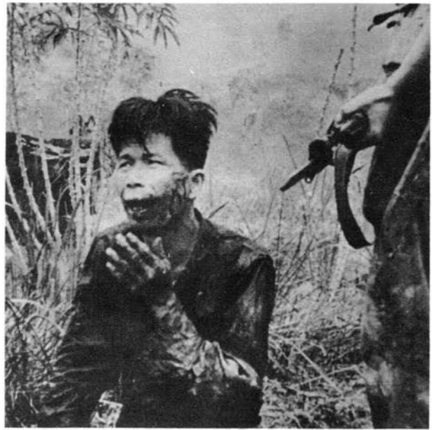
Terrorist wounded and captured by military patrol, 1950. Although the Communists sometimes spared Malayan prisoners, no British soldiers who fell into their hands could hope to survive.