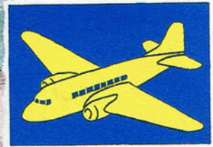
Air Despatch Organisation