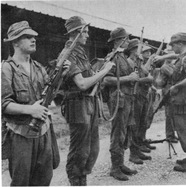
NCO of Royal West Kents checks that his patrol's weapons are unloaded after return to the company base, in 1953. Second man from left has an Australian Owen gun, while the NCO carries an American M2 carbine. Note individual styles of jungle hats.

Especially active in the task of persuading the jungle people to support the government was the Department of Aborigines. By the end of 1953 more than 200 Malay Field Assistants and Aborigine Field Staff were providing medical clinics, schools and trading posts. These facilities were established in seven jungle forts, garrisoned by platoons of the Police Field Force and regularly supplied by air. Eventually, by 1955, there would be ten forts strategically placed in Perak, Kelantan and Pahang.