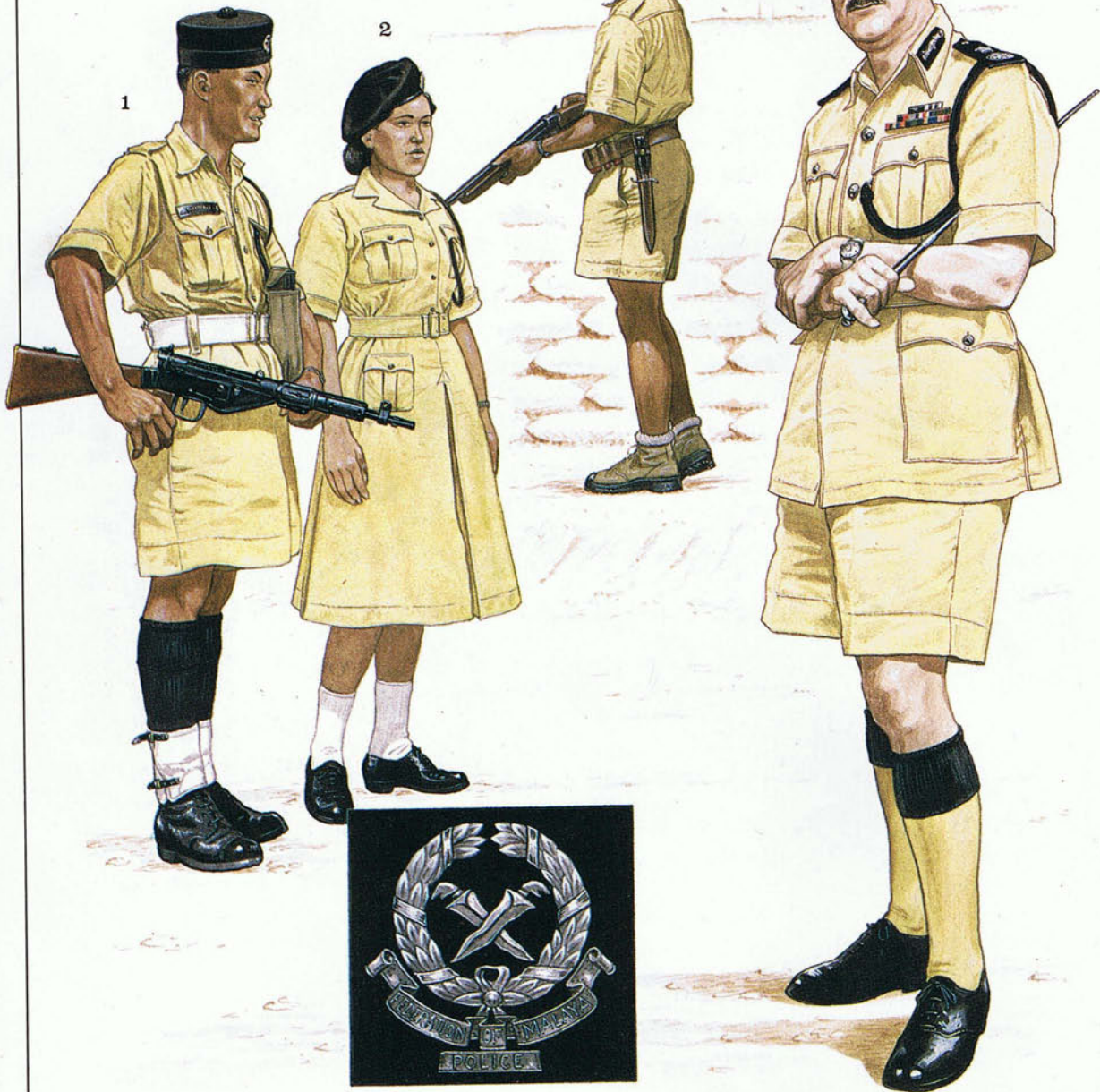
Cap-badge, all three figures wearing headgear