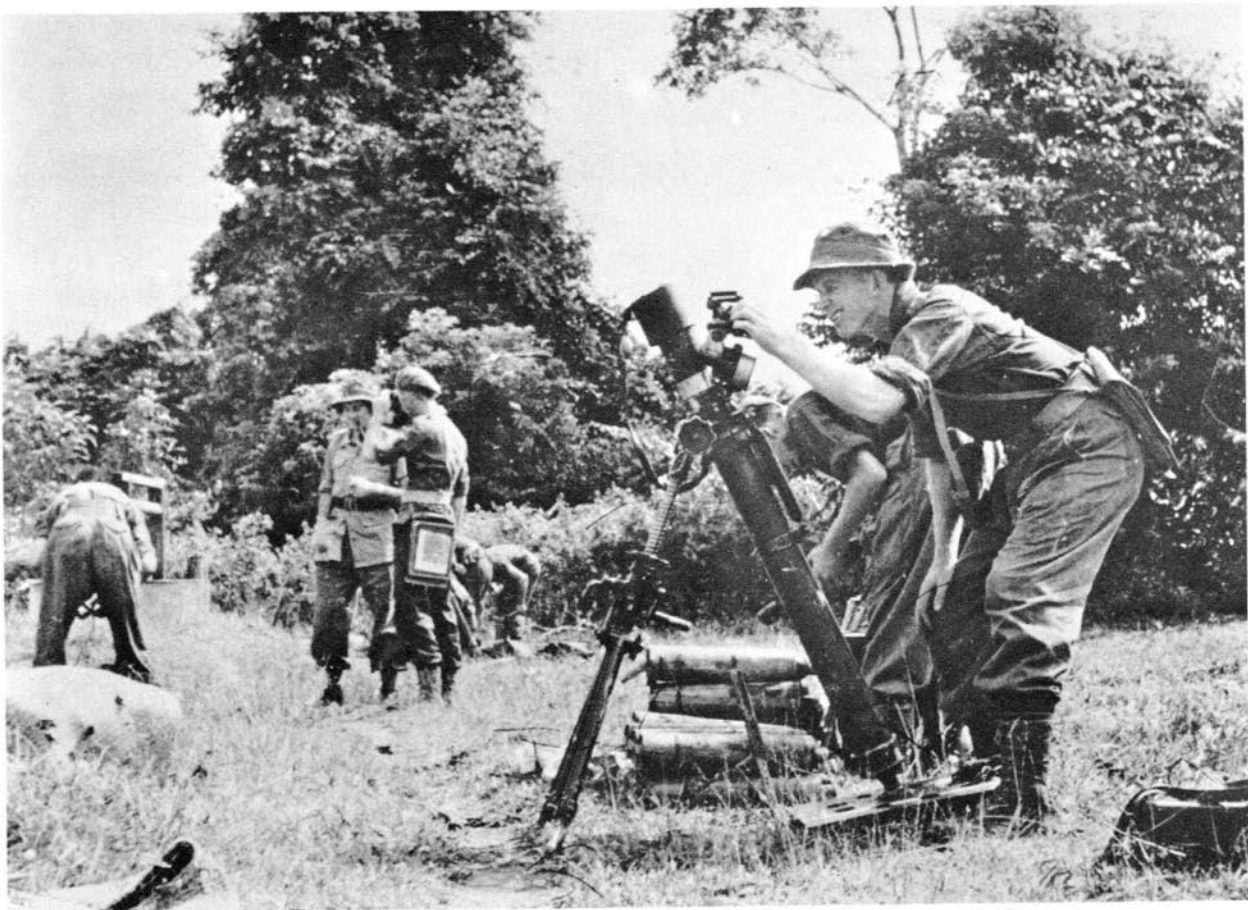
2nd Scots Guards set up 3in. mortars to bombard terrorist hideouts in Temerloh area of Pahang, 1949.

848 Naval Air Squadron; 28, 33, 45, 48, 52, 57, 60, 81, 84, 88, 97, 110, 155, 194, 205, 209, 267 and 656 Squadrons Royal Air Force; 91, 92, 93, 94, 95 and 96 Squadrons RAF Regiment (Malaya); 1, 2, 3, 38 and 77 Squadrons Royal Australian Air Force; 14, 41 and 75 Squadrons Royal New Zealand Air Force; and Penang, Singapore and Kuala Lumpur Squadrons Malayan Auxiliary Air Force.