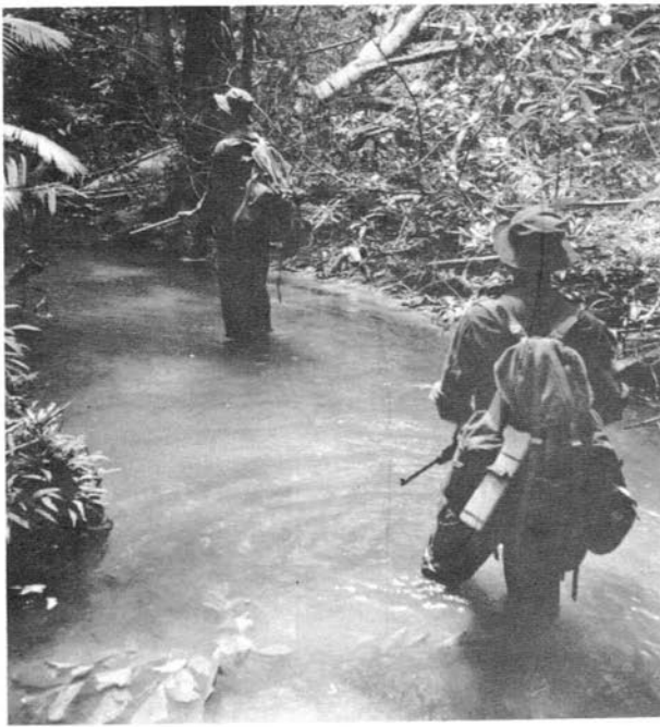
New Zealand SAS on patrol along the Perak/Kelantan border in 1956. Note Bergen rucksacks. The first trooper carries a Browning shotgun, the second an M1 carbine.

had been wounded during the attack and disclosed that he had, in fact, been the sole survivor. With 11 CTs killed and one captured, this classic action had given the Royal Hampshire the highest score of any company engagement since early 1950, and the highest total of terrorists eliminated in one encounter recorded by any British battalion.