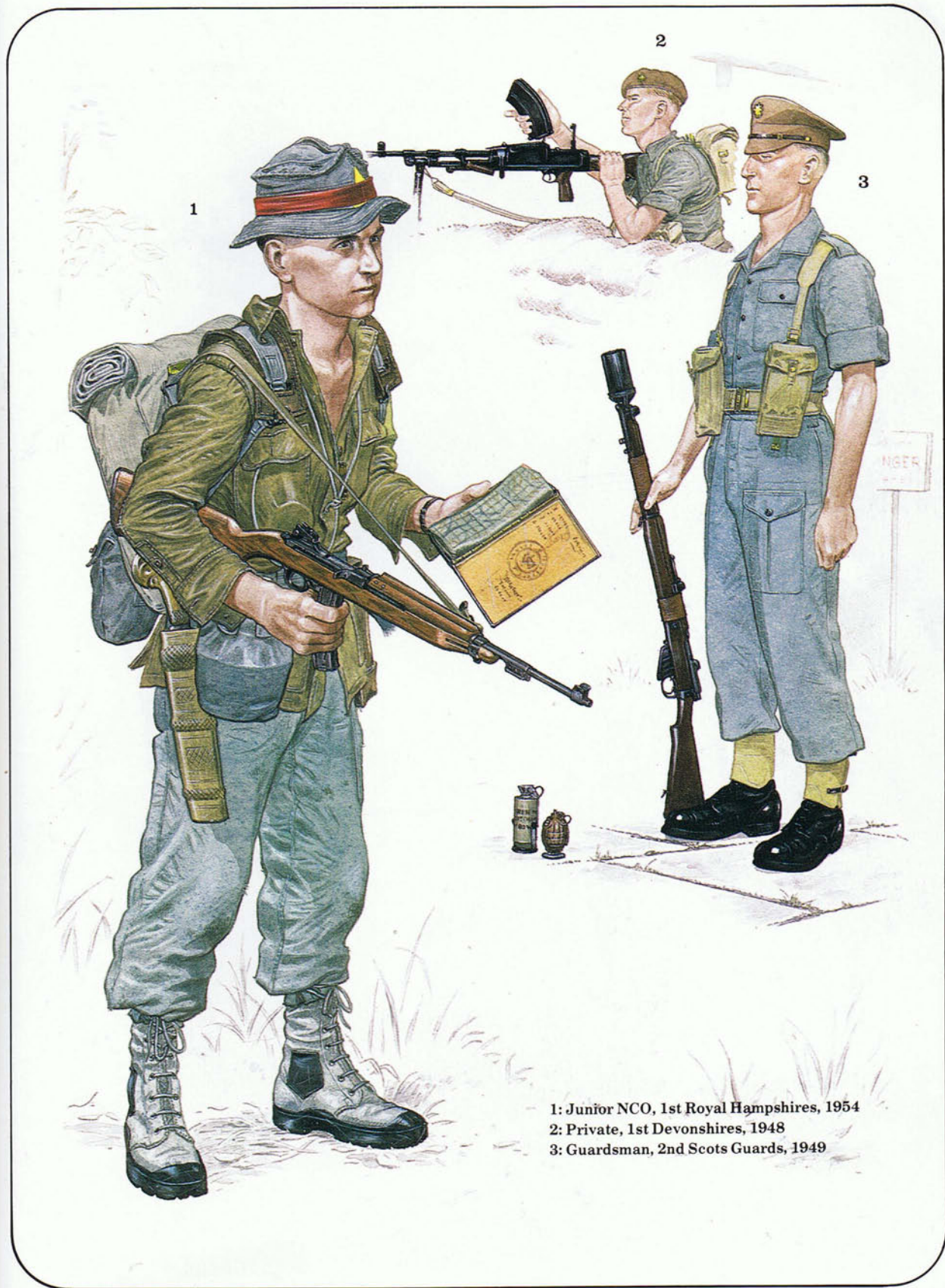
1: Junior NCO, 1st Royal Hampshires, 1954 2: Private, 1st Devonshires, 1948 3: Guardsman, 2nd Scots Guards, 1949