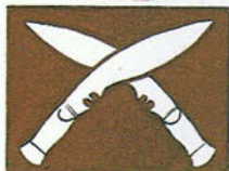
99th Gurkha Bde.