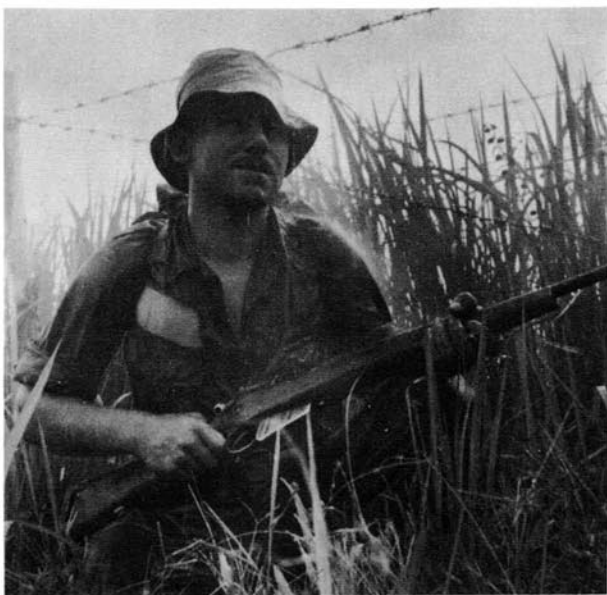
Royal West Kents rifleman on patrol in 1953, being drenched by the daily downpour, which was usually accompanied by a thunderstorm. (BBC Hulton Picture Library)

The Suffolks, aided by two companies of the Royal West Kents, waded for three days through the south swamp, ten miles by eight in area, in search of the camp. After numerous brief contacts fresh information, obtained from a captured