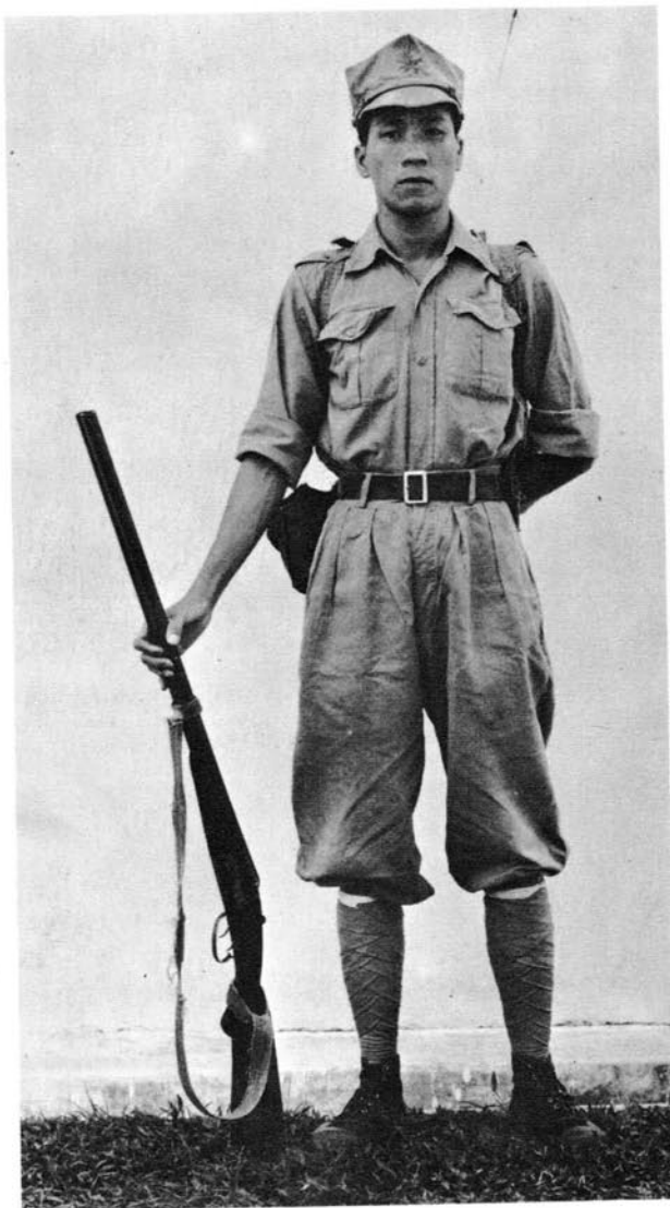
Captured Chinese terrorist, in KD uniform, puttees and red-starred cap, poses with his double-barrelled shotgun: 1953.