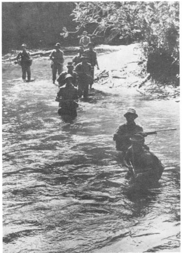
Patrol of the Federation Police Field Force crosses the Temengor River, Upper Perak, 1954. The leading scout is armed with a Sten SMG and the second with a Browning automatic shotgun.

Special Branch information obtained from an SEP in Selangor led to a very successful action in December 1955. The deserter had indicated that a course of political instruction for high-ranking CTs was being held in a camp within the jungle fringe, near the village of Ulu Langat. Con-