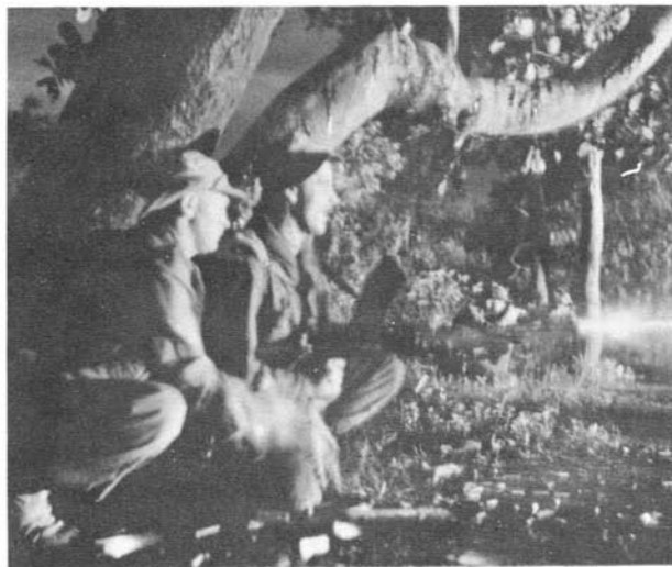
Rare night combat photograph of Bren gunner and riflemen of C company, 1st Loyal Regiment, based at Siputeh, during a midnight encounter with a CT gang in the jungle in 1957.

Dressed as for a regimental duty, this CSM wears his rank crown on a leather strap on his right wrist. The formation sign of the 18th Independent Infantry Brigade—crossed white bayonet and kukri on a red background—can be seen on the sleeve of the 1950 pattern JG bush shirt. The slip-on shoulder titles were unique to this regiment and worn by Other Ranks only. The bands of colour varied with each company—A being green, B yellow, HQ white, etc. The US Presidential Unit Citation, above the formation sign, indicates an ex-Gloster survivor of the epic battle of the Imjin River in Korea. (For administration purposes in the United Kingdom the infantry regiments of the south-western counties were grouped into the 'Wessex Brigade Group'; there was a good deal of cross-posting between battalions, to bring units up to strength as needed.)