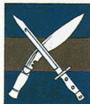
2nd Guards Bde.