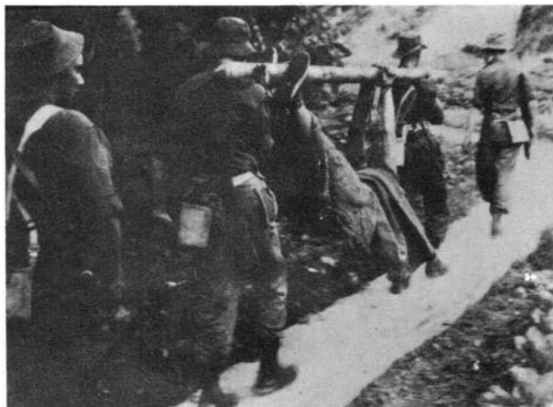
Guards patrol—believed to be 2nd Coldstreams—carry back a slain terrorist for identification by Special Branch. Note scrubbed 1937 pattern webbing equipment. Cameron Highlands, 1949.

3rd Grenadier Guards, 2nd Coldstream Guards, 2nd Scots Guards, 1st Queen's Royal Regiment, 1st Royal Lincolnshire Regiment, 1st Devonshire Regiment, 1st Suffolk Regiment, 1st Somerset Light Infantry, 1st West Yorkshire Regiment, 1st East Yorkshire Regiment, 1st Green Howards, 1st Royal Scots Fusiliers, 1st Cheshire Regiment, 2nd Royal Welsh Fusiliers, 1st South Wales Borderers, 1st King's Own Scottish Borderers, 1st Cameronians, 1st Royal Inniskilling Fusiliers, 1st Worcestershire Regiment, 1st Royal Hampshire Regiment, 1st Sherwood Foresters, 1st Loyal Regiment, 1st/3rd East Anglian Regiment, 1st Queen's Own Royal West Kent Regiment, 1st King's Own Yorkshire Light Infantry, 1st Wiltshire Regiment, 1st Manchester Regiment, 1st Seaforth Highlanders, 1st