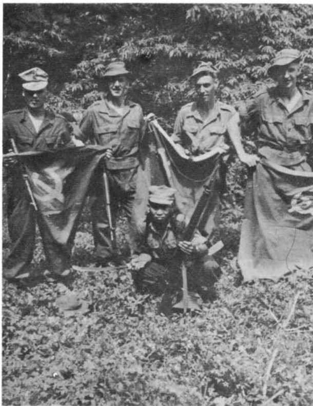
Men of 1st Cameronians displaying captured Communist flags and caps after the Iban tracker (crouching centre) led the patrol to a CT camp in Johore, 1951.