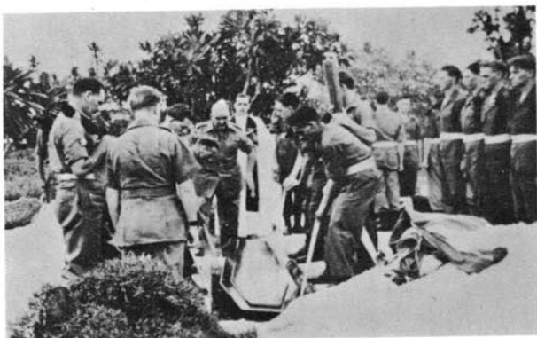
Men of D company, 1st KOYLI bury their dead at Batu Gajah civil cemetery, Perak, after a section had been ambushed in a defile near Ampang on 10 June 1950. Six soldiers were killed and one of the four wounded died a few days later.

occasions when a terrorist leaned up to fire, they shot and killed him. For 15 minutes the exchange of fire continued. When a grenade was thrown at the patrol it fell short and rolled back down into the stream. As the soldiers edged still closer one of the bandits sensed that he was cornered and made a run for it. Jumping over a fence, he was brought down by another fatal volley from the patrol. There were now only two terrorists left—a man and a girl.