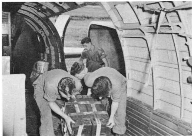
Men of 55 Company, RASC loading 3in. mortar bombs into a Valetta at Kuala Lumpur for parachuting to the 3rd Malay regiment on operations, 1957. The heroic 55 Company lost 43 dead in air crashes through their determination to ensure that patrols in the jungle received their rations and other supplies, no matter how bad the weather conditions.

stuck through his head-band, and is armed with a single-barrelled shotgun.