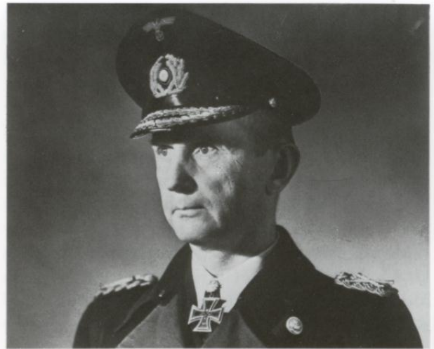
Dönitz, seen here in the uniform of Grossadmiral, learned from his operational experience in the 1914–18 War that concentrations of U-boats were a more effective weapon against Allied convoys than unco-ordinated attacks by single submarines. He devised the 'Wolf Pack' tactics which came close to inflicting unacceptable shipping losses on Great Britain, and Churchill later wrote that this was the Axis weapon which came closest to causing him to despair. A popular and inspiring commander of no very great intellectual attainments, Dönitz was defeated by a combination of successful Allied radio-decode intelligence and improved anti-submarine detection equipment. His own son was lost on U-boat operations in the Atlantic.

In spite of the failure of the attack Dietrich was sent in January 1945, with the remains of his 6th SS Panzer Army, to try to build up a front