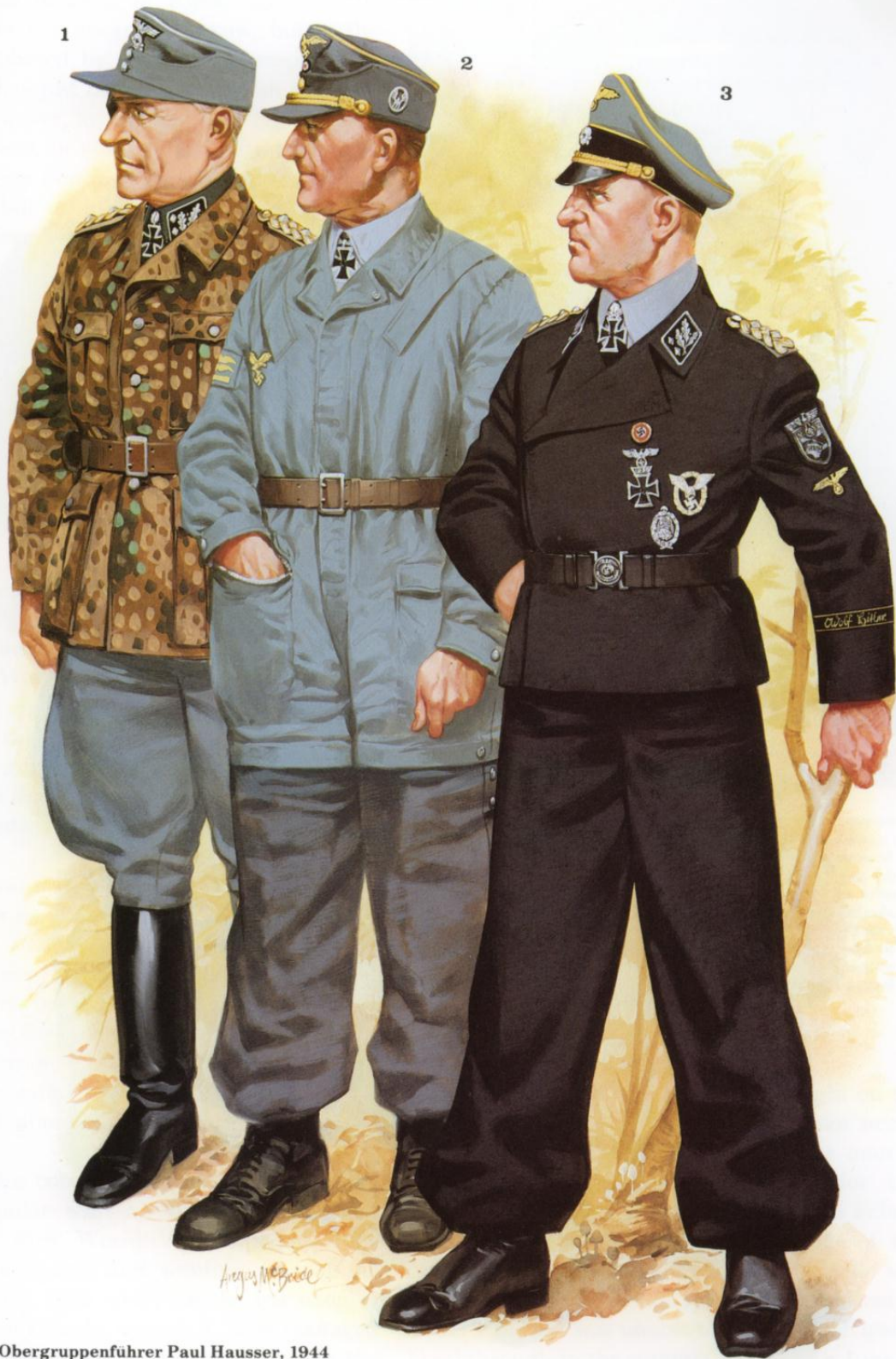
1. SS-Obergruppenführer Paul Hauser, 1944 2. Generalleutnant Eugen Meindl, 1944 3. SS-Obergruppenführer 'Sepp' Dietrich, 1944