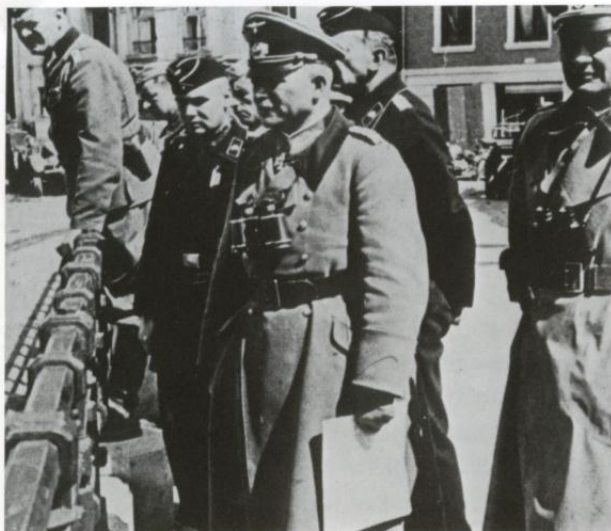
'Fast Heinz' Guderian flanked by Panzer officers on the French coast after his dazzling advance to the sea in summer 1940.

One of the main accused at Nürnberg, Dönitz was convicted of preparation for a war of aggression but received the comparatively mild sentence of ten years, all of which he served in Spandau prison. One of his fellow inmates, Albert Speer, referred to him as a lieutenant-commander who had been promoted too rapidly. Karl Dönitz died on Christmas Day 1980.