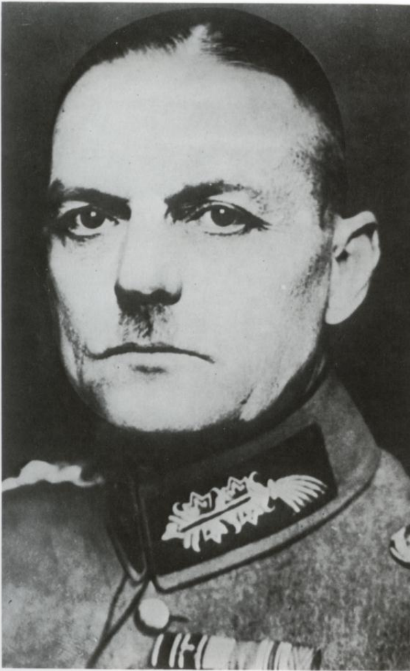
Gerd von Rundstedt photographed as a Reichswehr general in the early 1930s, wearing the stand-and-fall grey collar of the period. Plate A2 illustrates his habitual uniform during the war years, with the collar and shoulder insignia of his status as 'Chef' or Colonel-in-Chief of the 18th Infantry. Only six general officers received these regimental honours, and they were highly prized. There are many stories testifying to von Rundstedt's dry sense of humour, and his ability to mimic practically every known German regional accent was used to cruel effect when he allowed himself to express an opinion of the Nazi upstarts he so despised.

graphs of him show a stern face with a high intelligent forehead. He always dressed in full uniform – he was never a 'character' in the sense of preferring outlandish dress – but usually wore the insignia of a regimental colonel rather than the oakleaves of a general on his collar. Outwardly typical of his caste, he had a sardonic sense of humour and spoke quite openly to Allied interrogators after the war. His family was Prussian with a long tradition of service to the state –