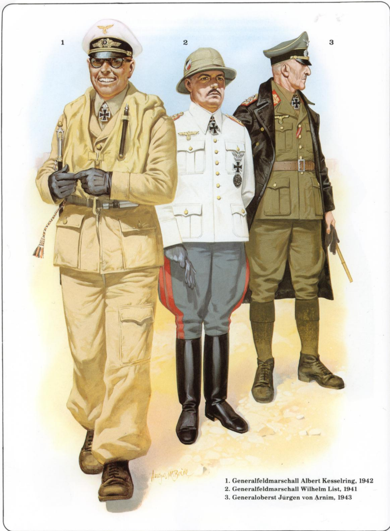
1. Generalfeldmarschall Albert Kesselring, 1942 2. Generalfeldmarschall Wilhelm List, 1941 3. Generaloberst Jürgen von Arnim, 1943