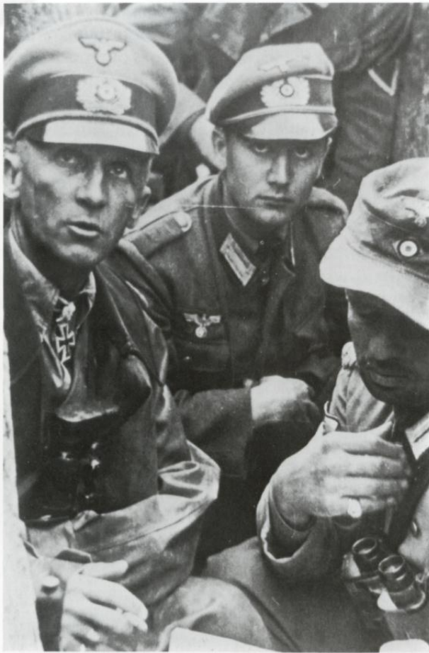
General of Armoured Troops Hasso von Manteuffel (left), the charismatic commander of the 'Grossdeutschland' Division, known as 'the Lion of Zhitomir' after fighting around that town in 1943. A member of one of the oldest Prussian military families, this bantam of a general was renowned for his politeness to subordinates: this extended, during one Russian air attack, to standing aside as his staff leapt into a slit-trench, with the words 'After you, gentlemen!' He twice used the risky tactics of launching major assaults without artillery preparation for the sake of surprise - a ruse which worked well both in the East and the Ardennes, where his forces made the most successful thrust in December 1944.

field cap has gold piping and, apparently, gold insignia - this was authorised for generals on 1 January 1943, but they were ordered not to wear it until after the war, an order quite frequently ignored. His service tunic is slightly unusual in having straight pocket flaps and no box pleats; in field grey, it is worn with striped breeches in contrasting 'new grey'. Cases of two cuff titles being worn on one sleeve are not common; von Manteuffel was entitled to the 'Afrika' campaign and 'Grossdeutschland' divi-