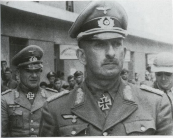
A stony-faced von Arnim, followed by his chief-of-staff Gen. Kramer, surrenders the Axis forces in North Africa to the Allies, May 1943. Born in 1889, this scion of a traditional Prussian family made his name as commander of 17th Panzer Division in Russia in 1941, and later led XXXIX Panzer Korps in the relief of the Kholm pocket, cut off for three months. Posted to Africa, he did not work well with Rommel, by now a sick and exhausted man.

normal pinned escutcheons on each side; it seems to differ in small details from the enlisted men's version, and has a false paggri effect. The 'new style' officer's white summer tunic has patch side pockets and a fall collar worn without ranking patches: note pin-on eagle. It is worn with the standard red-striped field grey breeches.