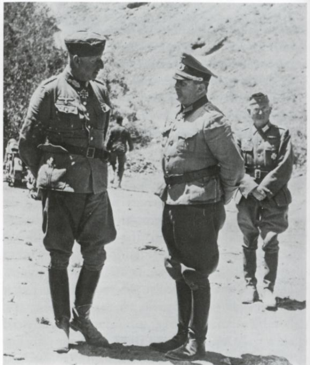
Erich von Manstein (left) with Oberst von Choltitz, who commanded the infantry regiment which was instrumental in breaking into the Sevastopol defences in summer 1942. Promoted field marshal for his success in the Crimea, von Manstein has enjoyed perhaps the highest reputation of any German general. It was said of him that he experienced with equally impressive grasp the three classic phases of war: attack, siege, and retreat. Von Choltitz later became commandant of Paris, and refused to obey Hitler's order to demolish the Seine bridges and burn the city to the ground. Twenty years later a French magazine invited him back to the city he had refused to destroy.

E3: General der Infanterie Erich von Manstein, 1942 The conqueror of the Crimea photographed as commander of 11th Army. He wears a field grey sidecap - Feldmütze - with gold piping. His uniform is absolutely regulation for his rank, and rather plain. Photos taken later in the war show him wearing a service tunic with a field grey collar, and gold cap insignia. He has a version of the Iron Cross 1st Class with the 1939 bar actually welded to the top. He sometimes wore the cross of the Rumanian Order of Michael the Victor 2nd Class suspended below his Knight's Cross.