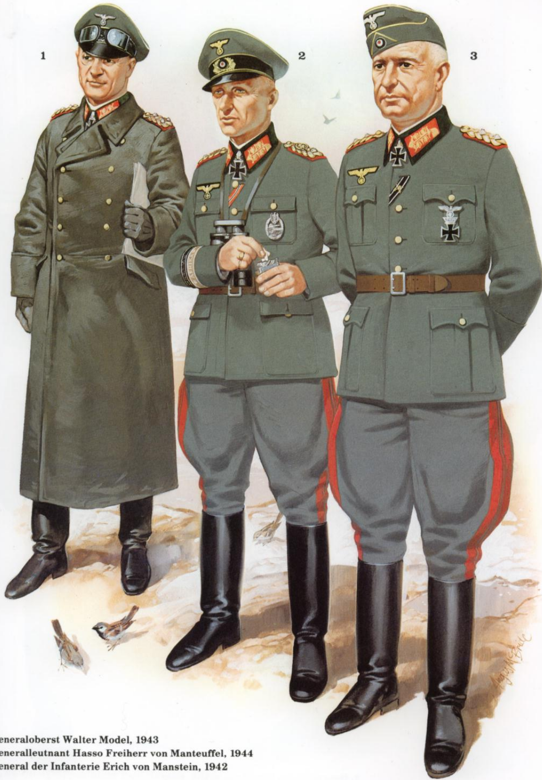
1. Generaloberst Walter Model, 1943 2. Generalleutnant Hasso Freiherr von Manteuffel, 1944 3. General der Infanterie Erich von Manstein, 1942