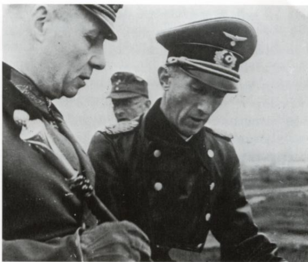
Rommel receives a briefing on the Atlantic Wall defences early in 1944. It was largely due to his energy in stripping old 1940-vintage French and Belgian defences that the vaunted image spread by the propaganda service was transformed into a genuinely formidable defence line by June 1944, when it almost withstood the US landings at Omaha Beach.

Wavell once compared Rommel to Wellington, and even during the war he was almost as popular with the 8th Army as was Montgomery. The British regarded him as a gentleman, and, unlike the rest of the German generals, he has been the subject of a considerable number of