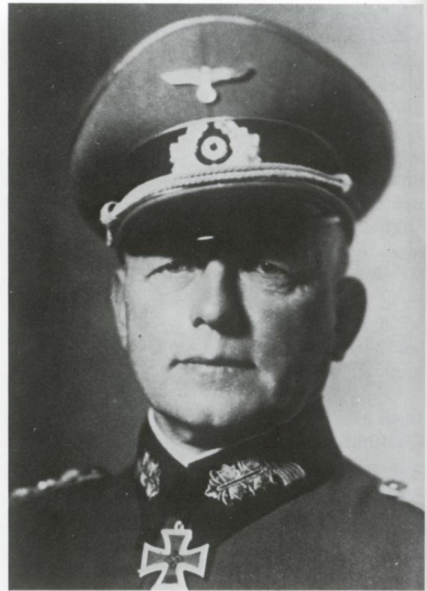
Ewald von Kleist received the Swords to his Knight's Cross in March 1944, as sweetening for the bitter pill of dismissal from command of Army Group A, which he had saved from encirclement in the Caucasus and withdrawn through the narrow Rostov corridor in January-March 1944. This withdrawal was marred by the failure to extricate the Crimean garrison, which lost 26,700 out of 64,700 men. Von Kleist was highly regarded by his colleagues for his old-fashioned virtues and unflappable control in attack and retreat alike.

It was in France that von Kleist first acquired