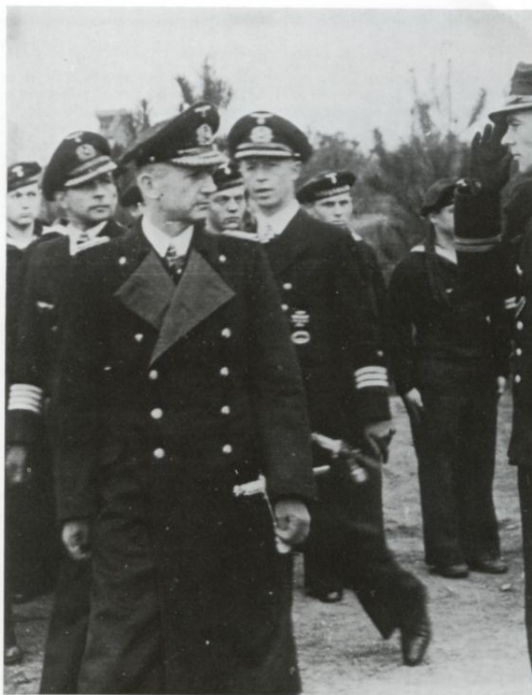
Dönitz with some of his U-boat commanders in May 1943, as C-in-C of the German Navy. By this date the tide was turning in favour of the Allies in the submarine war; March 1943 was the last really dangerous month, with 108 vessels totalling 627,000 tons sunk. In May 40 U-boats were destroyed at sea or in their pens; in July 37 were sunk, mostly by the growing Allied maritime air effort; and by the end of 1943 the Allies were losing only some 80,000 tons a month.

Fegelein, as husband of the sister of Eva Braun, served out the last months of the war as Himmler's SS liaison officer at the Führerbunker. He was suspected of complicity with Himmler in un-