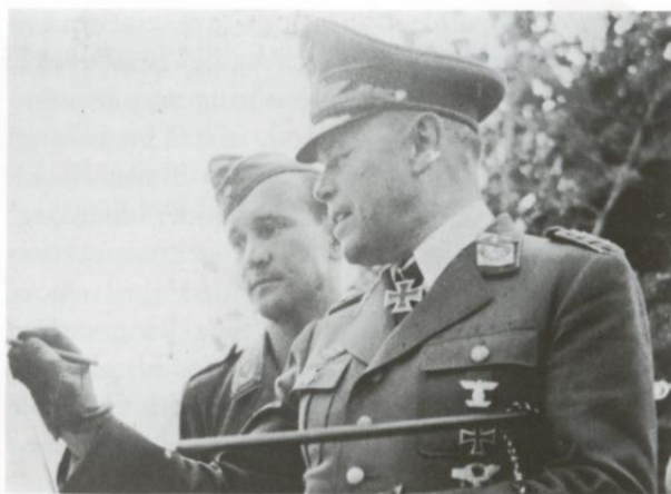
Kesselring as an Air Fleet commander in 1940. As Supreme Commander South his wide responsibilities sometimes caused friction between himself and Rommel, his often-impetuous subordinate. Rommel's constant demands for air support and convoy escorts drew some stinging replies, and his staff were secretly delighted when Kesselring came under RAF attack during one visit to the desert, their delight turning to rapture when Kesselring leapt into a slit trench that had been used for kitchen refuse..

Never tried as a war criminal, Guderian retired to write his memoirs and died in 1954.