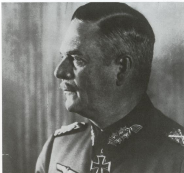
Two studies of Generalfeldmarschall Wilhelm Keitel - a confident studio portrait showing him at the pinnacle of his fame as head of OKW (Armed Forces High Command); and a Russian photograph of his signing of the instrument of surrender in 1945. Keitel, who owed his position to his marriage to von Blomberg's daughter, was an unintelligent and characterless yes-man who acted as the conduit between Hitler and his generals; respected by nobody, he survived throughout the war simply by virtue of dog-like loyalty to a master who described him as having 'the brains of a cinema usher'. Among professional colleagues he was known as 'Nickeitel' or 'Lackeitel' - 'nodding' or 'lackey' Keitel. His signature was found on many damning documents, and he was hanged for war crimes on 16 October 1945.

In Germany the Army had always been the senior service and had a long history of involvement in politics. This remained indirectly the