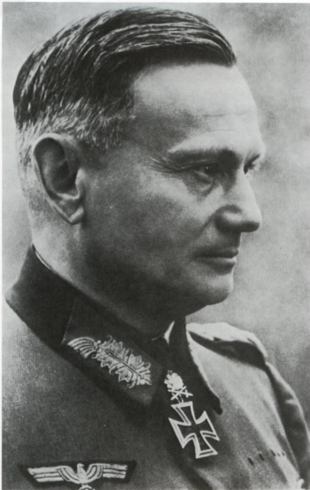
Hermann Balck at the height of his career, decorated with the Swords and Oakleaves to the Knight's Cross. He was a man of great physical courage, once leading an attack in person armed with a walking stick, and on another occasion driving among attacking T-34s in his Kübelwagen, complete with command pennant, on the grounds that at close range their poor visibility kept him safe. His moral courage was also notable; he once told the formidable Model that his impulsive interference was unsettling his subordinates, and successfully dissuaded 'the Führer's fireman' from making any more lightning descents on XLVIII Panzer-Korps.

In Holland Student displayed tenacity and organisational capability in defending the country with his paratroops and whatever other units he could scrape together. In October he became commander of Army Group H with control over all forces in the north of Holland, but was relieved by Blaskowitz in February 1945. From then until the final surrender he remained in charge of his parachute army, a tough, well-disciplined force.