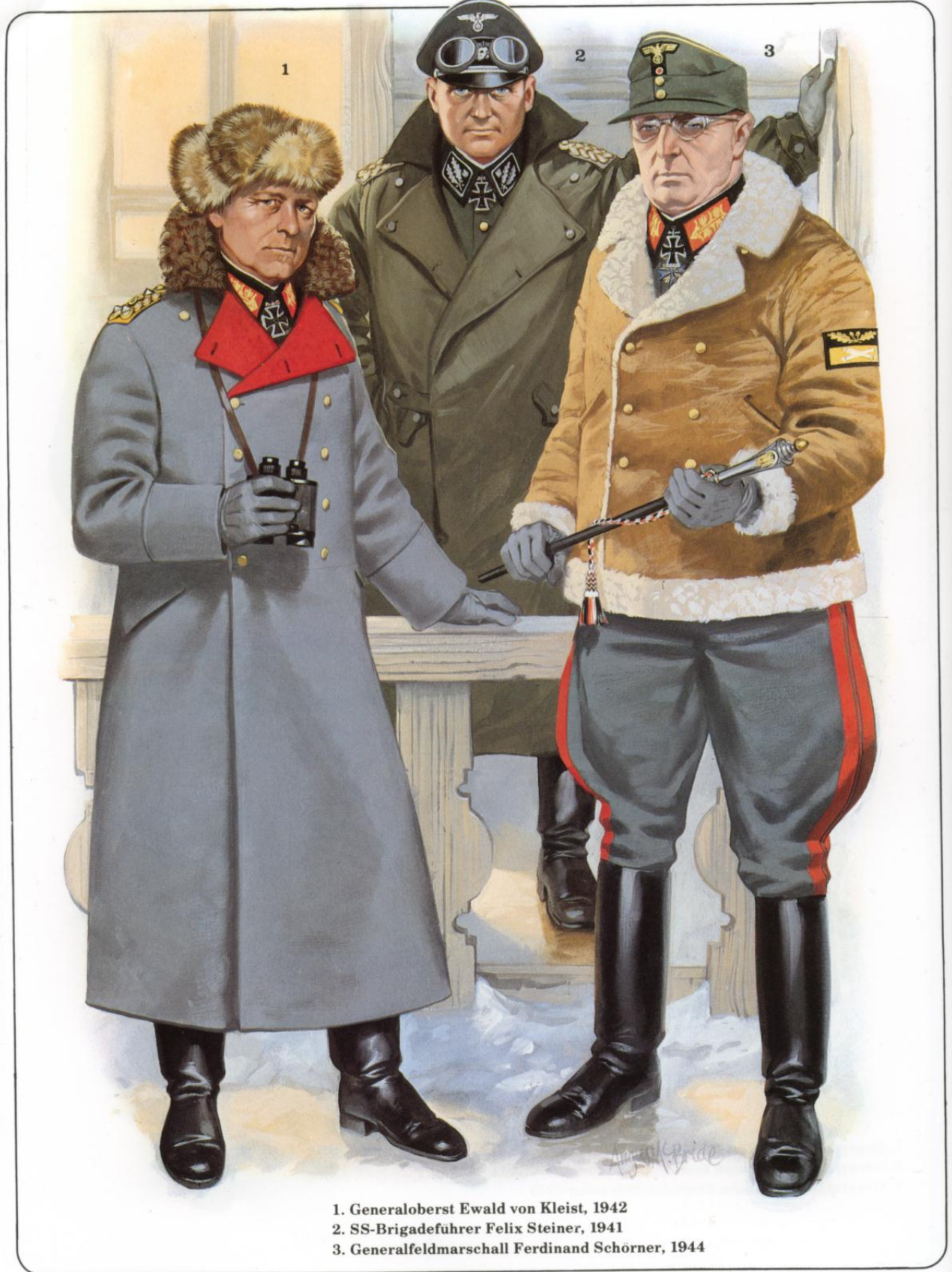
1. Generaloberst Ewald von Kleist, 1942 2. SS-Brigadeführer Felix Steiner, 1941 3. Generalfeldmarschall Ferdinand Schörner, 1944