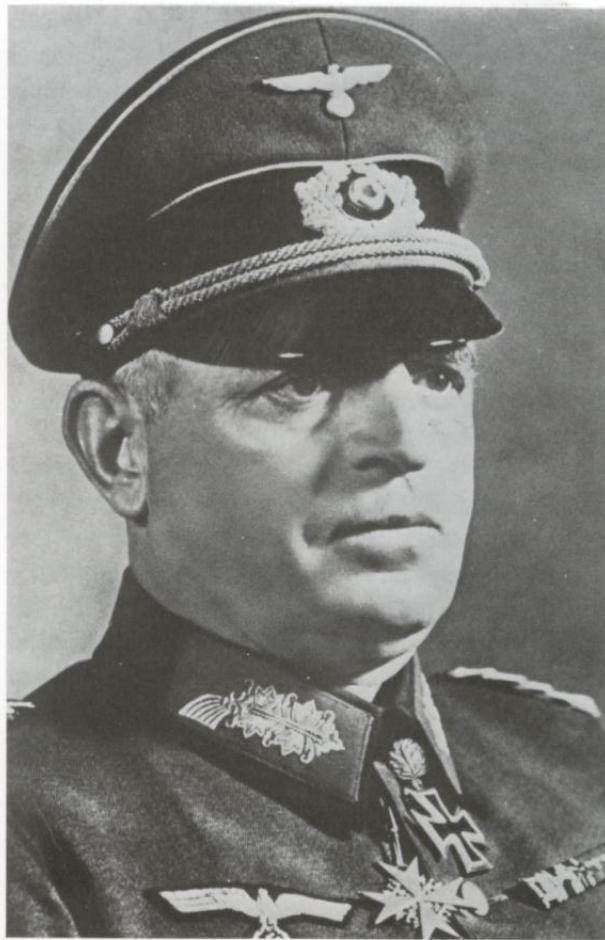
Ernst Busch wearing medals for physical courage earned in two World Wars; sadly, it seems that his moral courage was of a less impressive order. He obeyed patently absurd 'no retreat' orders from OKW; and when in June 1944 his 34 divisions were swamped by 200 Soviet divisions he tried to compel the commander of 4th Army, Tippelskirch, to counter-attack after that able and experienced officer had used his initiative to withdraw the shattered remnant of his troops across the Dniepr. His reputation preceded him to the West, where even junior subordinates tended to regard his orders with extreme cynicism.

Busch led his corps in Poland with distinction and was popular with his men, perhaps as a result of his First World War experience. In France in the spring and summer of 1940 he commanded the 16th Army on the left wing of von Rundstedt's Army Group A, and managed to capture Verdun in a matter of hours. At the close of the French campaign he was awarded the Ritterkreuz and promoted to colonel-general.