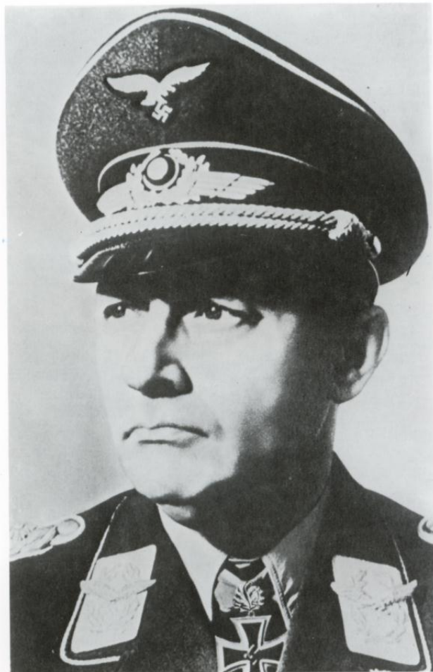
This portrait of Kurt Student shows to good effect the impressive gold-on-white collar patches of a Luftwaffe colonel-general. Eugen Meindl (see Plate G2) once said that Student 'had big ideas but not the faintest concept as to how they were to be carried out' - a disloyal remark for an officer who had been well treated by his superior, and one hard to reconcile with the evidence of Student's originality and energy as creator of the crack airborne forces. Men who did not know him sometimes mistook a characteristic slowness of speech for slowness of wit - an error which would have surprised his respectful and admiring enemies.

Although in no way a Nazi he was never connected with the bomb plot. He even acted as president of the Court of Honour which expelled the plotters from the Army. In early September, however, he was again brought out of retirement and re-appointed as Supreme Commander West - with orders to stop the rot. He remained as a rather splendid figurehead, and it is an injustice to couple his name with the Ardennes offensive. He had nothing to do with the planning or execution of an operation in which he had no faith.