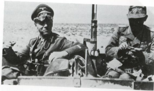
A typical snapshot of Rommel, snatching a hasty meal in his command car, well forward with his front-line tanks. Recent commentators who have correctly pointed out the limitations of this perhaps over-eulogised general cannot detract from his genuinely impressive achievements and attractive character. He was worshipped by his men, and frequently displayed great physical courage.

and aggressive, specialising in directing the Stukas of his VIII Air Corps in close liaison with leading tank elements – a skill perfected in Spain, in France in 1940, in the Mediterranean and in Russia. In summer 1942 he was given 4th Air Fleet, totalling 39 Gruppen of fighters, bombers and Stukas, and supported Army Group South in the Don offensive. We take this painting from a colour snapshot taken when he landed his Fi 156 Storch to confer with 6. Panzer-Division. He wears the Luftwaffe Schirmmütze , which for generals had gold insignia and fittings; the fly-fronted Fliegerbluse , piped gold at the collar, with the white-backed shoulder straps and beautiful gold-on-white collar patches of his rank; and white-striped Luftwaffe general's breeches. A very rare decoration is worn on the right sleeve – the commemorative cuff title of Manfred von Richthofen's First World War 'flying circus' in dark blue with silver lettering in two lines: 'Jagdgeschwader Frhr.v. Richthofen Nr.1 1917/18'.