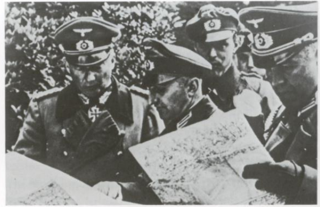
Günther von Kluge (left) earned Hitler's favour by a hard-driving style of leadership, but his attitude to the anti-Hitler resistance group among the generals was ambiguous. A difficult colleague, 'clever Hans' once challenged Guderian to a duel with pistols – with Hitler as his second!

Active command of ground troops came in July 1943, when Italy surrendered and the Allies invaded the mainland. Initially he had two armies, and from then until early 1945 he conducted the brilliant series of defensive battles up the leg of Italy that so effectively slowed the Allied advance. During this period his priority in terms of supplies and manpower was low and he had to make do with what he had got. For his handling of the early stages of the battle he was