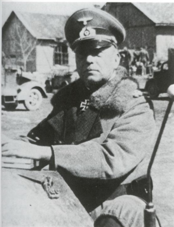
Ewald von Kleist, wearing the fur-collared greatcoat illustrated in Plate F1.