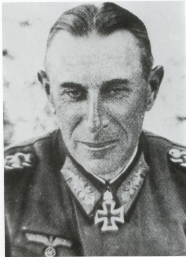
The unmistakable vulpine features of Generaloberst Rudolf Schmidt, the tank general who led 1st Panzer Division and later XXXIV Panzer Korps in Holland, France and Russia, where he served with distinction under Hoth. He was given 2nd Panzer Army after Guderian's dismissal just after Christmas 1941, and fought a series of successful battles around Orel and Bryansk in 1942. He was, in private, an outspoken critic of the Nazis, and was dismissed in 1943 following his brother's arrest by the Gestapo and the discovery of letters from the general.

This famous tank general is shown as he appeared in his final month as commander of Panzer-Division 'Grossdeutschland', just before his appointment to 5. Panzer-Armee. His 'old style'