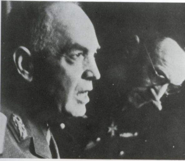
The hatchet face of Ferdinand Schörner can be seen on the right, beyond Marshal Antonescu, the Rumanian national leader. Among German generals Schörner stands unique as the one man Hitler held in awe. Though very harsh on rear echelon troops, he sometimes deliberately disobeyed Hitler's orders if they meant needless front-line losses. He was a coarse, vulgar man, who boasted a Gold Party Badge as an early member of the NSDAP; and in Russia his ruthlessness matched that of the enemy he faced. Though deprived of a pension after his release from prison in the 1950s, he received monthly cheques of equivalent value from a voluntary collection among veterans of the 6th Mountain Division which he had commanded in the Balkans and Russia.

served as a volunteer for a year in the Bavarian Army. After this he settled down to study philosophy and modern languages with a view to becoming a schoolmaster. His academic career was cut short by the outbreak of the First World War, however, most of which he spent as a lieutenant and company commander. In spite of the humble rank, the reservist Schörner covered himself with glory, earning both Iron Crosses and the Pour le Mérite, as well as a reputation for toughness.