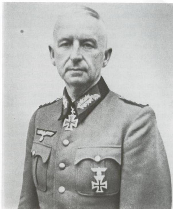
Erich von Manstein in 1940, as a brilliant planner and commander of XXXVIII Infantry Corps; he proposed the hook through the Ardennes which was to be the ruin of the Allied defences, and under his command the infantry proved to be a tough and flexible weapon, almost keeping up with the tanks. This photo provides an interesting contrast to those taken three years later, when his face was deeply etched by the fatigue and responsibility of command in Russia.

In 1936 he was promoted to major-general and worked on the staff to further the development of tanks and assault guns; but when the Army was purged in February 1938 he was sent off to command an infantry division in the provinces with the rank of lieutenant-general.