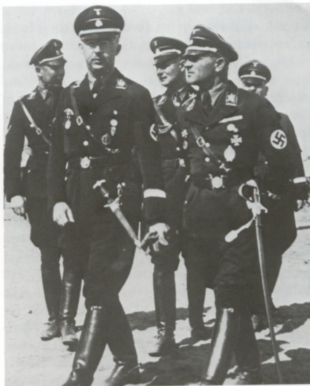
Joseph 'Sepp' Dietrich, on Himmler's left in this pre-war group, commanded the premier combat formation of the Waffen-SS throughout the war. This photo showing him in the black pre-war service dress of the SS is a useful reminder that the bluff, brave, hard-mouthed tank general described by von Rundstedt as 'decent, but stupid' owed his promotion to ruthless support of Hitler in the bloody period of political gang-warfare. There is deep irony in his earliest recorded civilian trade - butcher's apprentice.

meetings, he functioned as the chief bouncer; and incredible as it may seem, by 1933 he was the equivalent in the SS of a major-general. In the same year he took command of Hitler's 'household bodyguard', the 'Leibstandarte Adolf Hitler', and with his troops played a leading part in the arrest and murder of Röhm and the other SA leaders in June 1934. Dietrich was in charge of the execution squad at the Stadelheim prison in Munich.