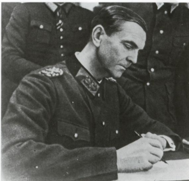
Generalfeldmarschall Friedrich Paulus (1890-1951) photographed as a PoW in Russia after his capture at Stalingrad; note that the Nazi national emblem has been removed from the breast, although rank insignia are retained. He is supposedly signing an appeal by the German Officers' League, part of the National Committee for Free Germany organised by German Communists in the USSR. A very capable Hessian staff officer, Paulus was given to slow and deliberate calculations; had a younger and more impulsive officer been in command, 6th Army might have achieved at least a partial break-out from the Stalingrad encirclement in defiance of Hitler's 'last man, last bullet' orders. Paulus lived in East Germany after the war.

During the winter he was employed in organising the defence in the Vosges sector, and in January 1945 he was placed in command of Army Group H, which was holding the front in the Low Countries. This again was hardly a plum job, but