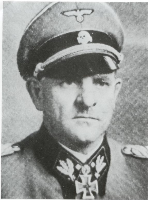
SS-Obergruppenführer und General der Waffen-SS Joseph Dietrich, wearing normal field grey service uniform and the special gold-piped service cap unique to him; note the Army-style silver-on-green eagle badge on the crown, and compare with the slightly different cap on Plate G3.

His personally-acquired pale sheepskin coat has on the left upper arm the patch of this rank according to the sequence of insignia introduced to the Army in mid-1942 for wear on all clothing not displaying shoulder straps.