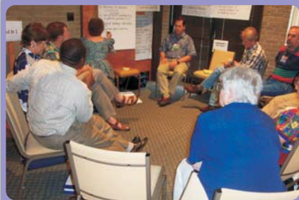
Small group discussion