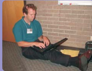
Checking email whenever time permits