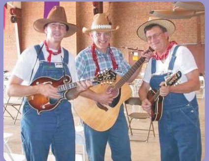
Some lively time