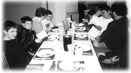
Participants from 2001 Seder Meal