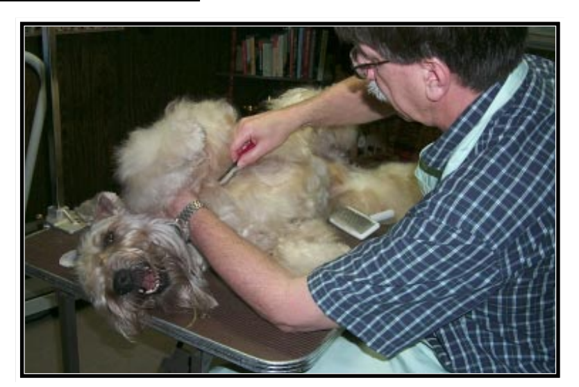
As a young puppy, Max was taught to cooperate on the grooming table for his weekly comb out.

Ears: Ear infections can be excruciatingly painful. Examine the ears for problems and clean them once a week to fend off infection. Dampness in the ear canal promotes formation of bacteria and fungus - the reason for placing cotton balls in the ears at bath time. To keep the ears clean do the following: While holding the ear up and back, use a cotton ball to remove surface dirt in the ear canal. Place recommended amount of ear cleaning solution in the ear. Gently massage the base of the ear between thumb and forefinger to work solution throughout ear. Gently wipe out the ear with cotton ball or gauze pad. Repeat until canal is clean and dry. If your dog