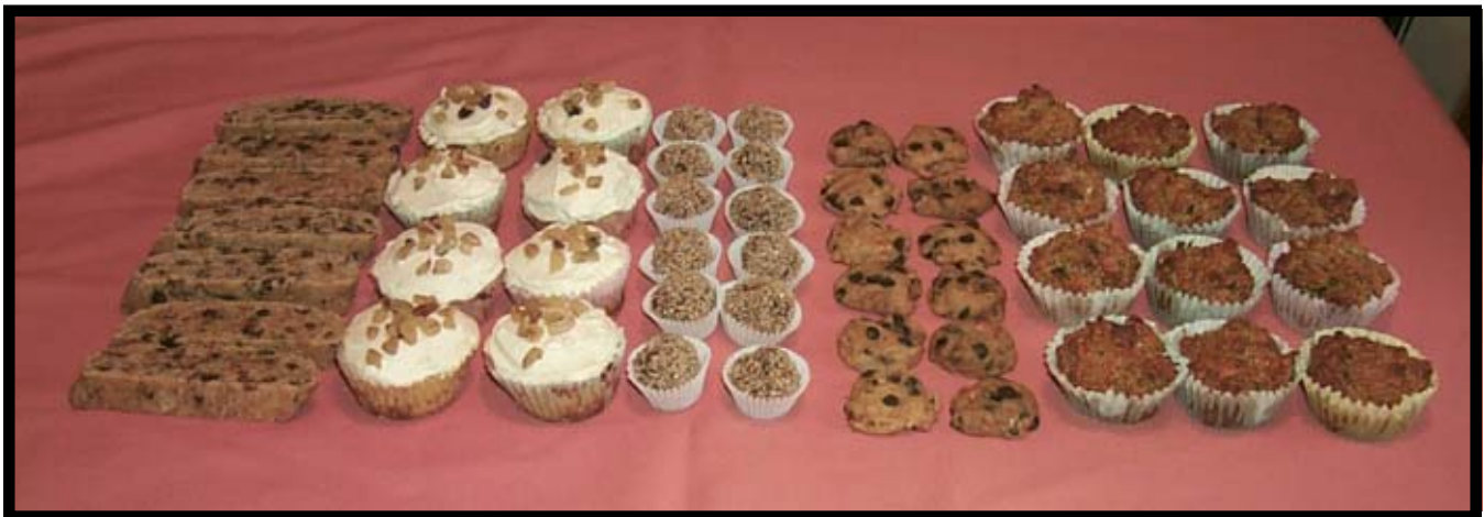
Shown left to right: Peanut Butter Biscotti, Party Pupcakes, Carob Truffles, Carob Chip Cookies and Healthy Muffins

For a single layer cake, spoon the batter into a sheet pan and bake for an extra 15 - 20 minutes or until toothpick comes out clean. Let the cake cool then decorate with frosting and walnuts.