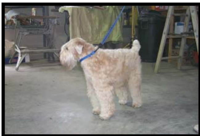
Riley "After" is ready to head home.