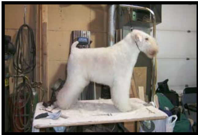
Spencer "After". What a handsome fellow!