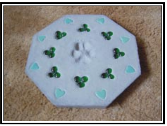
Max's stepping stone has flat green glass ovals pressed into the wet cement in the shape of shamrocks. Light green ceramic hearts finish off the design.

Choose your decorations and design prior to mixing the cement. Designing it on a pattern of your stepping stone, traced using the mold, is a good idea. Be creative. Try seashells, marbles, beach glass, mosaic tiles, buttons, small toys, or mementos. Avoid wooden items as they don't stick into the concrete very well. Once the cement is poured into the mold it can crack if moved. I found that placing the mold on a wooden tray allowed me to put it on the floor for paw printing then move it to a safe location without the cement cracking. Let your stepping stones set in the mold for 3 days before removing. Wait a week before placing them outside or stepping on them.