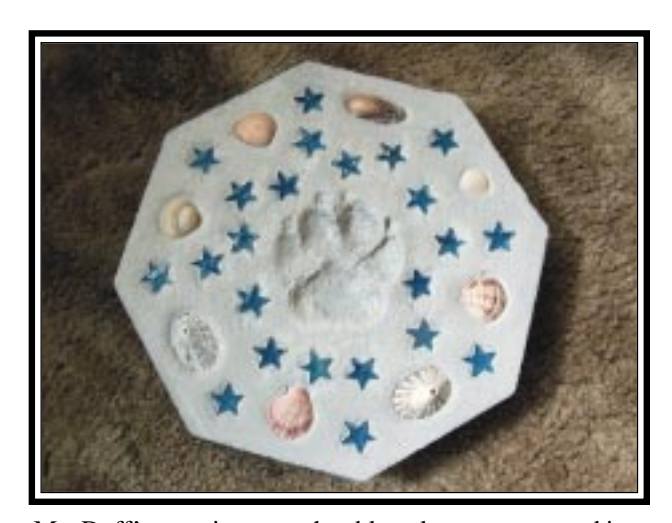
MacDuff's stepping stone has blue glass stars pressed into the wet cement. Sea shells at each corner finish off this stepping stone.

"He is your friend, your partner, your defender, your dog. You are his life, his love, his leader. He will be yours, faithful and true, to the last beat of his heart. You owe it to him to be worthy of such devotion" - Unknown