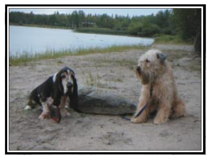
Beautiful Candle Lake in north central Saskatchewan