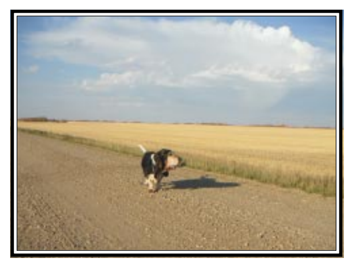
Saskatchewan, the breadbasket of Canada