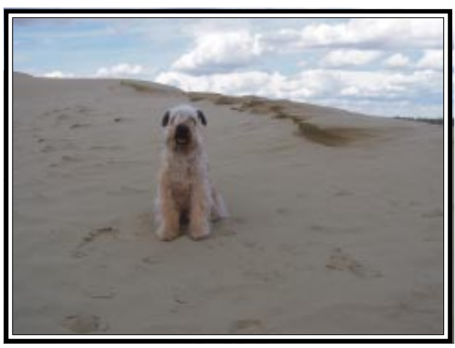
The Great Sand Hills in southeastern Saskatchewan