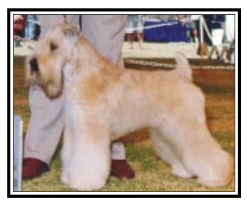
Am. Can. Ch. Gleanngay Maximilian