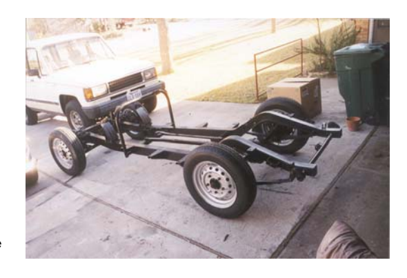
My TF-1500 is ready for the track, with the ultimate in lightening technology

Styling Attractive, but not for everybody Same