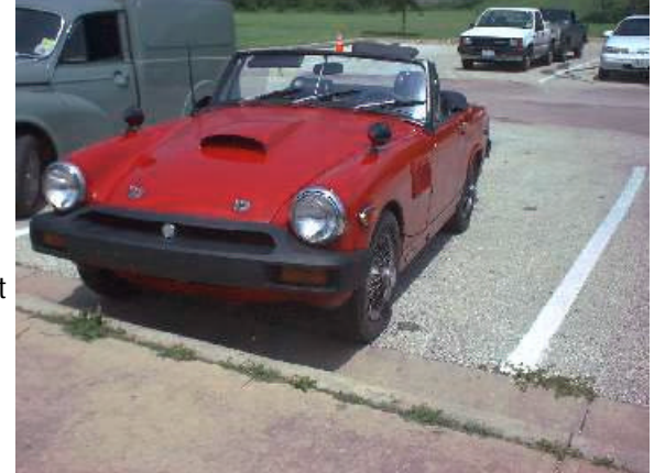
The HARE: Mighty Ferrettimobile

What will you need to participate? First a vehicle with an