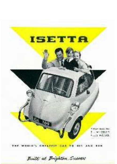
Image courtesy Trevor Boicey http://www.brit.ca/~tboicey/comics.html