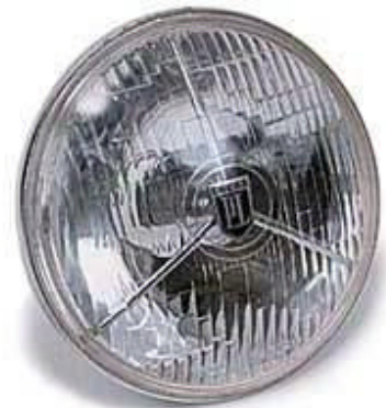
The famous Lucas PL "Tripod" lamp

Did you know... Lucas lamps do not actually produce light, instead they function by sucking dark.