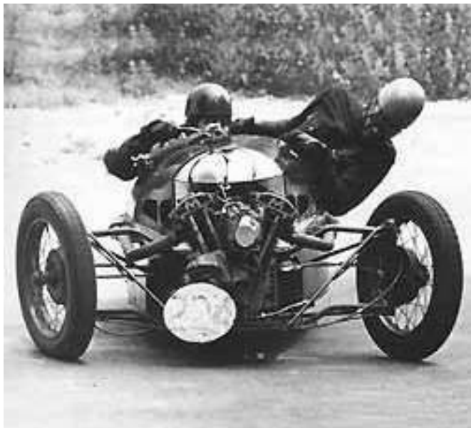
Morgan 3 wheeler at speed