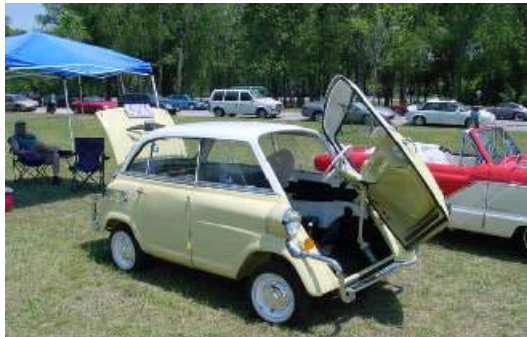
Not British: a BMW Isetta. Note the easy entry/exit, and as we see in the ad above, these cars were built in Britain