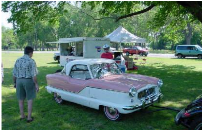
"Well, I'll be gobsmacked, it's rather a lovely Metro, isn't it." NOTE: MG manufactured most of the parts for the NASH Metropolitan.

June Meeting: Tuesday the 19th at Threadgill's restaurant, Riv- erside and Barton Springs Road at 7:30 p.m. Come early to enjoy the fine food and drink and company of fellow MG'ers