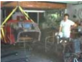
The TF body tub, hanging on a sling, is lifted off the frame

It's a magnificent obsession, but oh, what a price. I don't expect to have any free time for at least a few years to come, and who knows where the money I need to finish the restoration is coming from. Let's see, if I spend ALL of my disposable income on the TF, and do most of the work myself ... hmm .... Well best not to overthink it .... I hope to get the car driveable before retirement, because then I hope to spend my time driving the car rather than working on it fulltime.