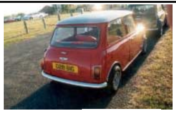
<no caption needed>

On a beautiful day in October, 2001, 89 cars gathered on a grassy knoll in Round Rock as enthusiasts from all over Texas gathered to see fine art wrought from steel and glass by hard-drinking laborers in England's factory towns of Abingdon, Coventry, and Longbridge. British Cars are a different sort of art than a painting, though, more than something pretty to look at, a fine British car can transform your experience of the world, the sound of the engine and the wind in your hair can bring sanity and calm (temporarily) back to a crazy and shattered existence. While the British Car habit can be as expensive as a drug addiction, it is different because it gives you more than it takes, and connects you to