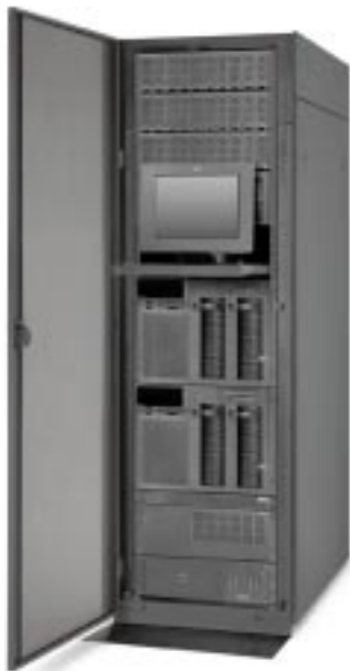
NetBAY™ 42 Enterprise Rack

*Sm@rtPartner magazine, September 18, 2000.