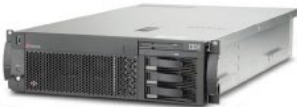
IBM @server xSeries 360

IBM @server xSeries systems are the critical Intel processor-based component of @server solutions. They deliver on the @server vision to bring you application flexibility, new tools and innovative technology via the X-Architecture™ blueprint.