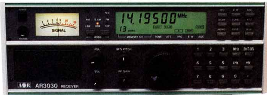
AR3030 viewed from the front.

for the different amateur bands and broadcast bands and the last used frequency, mode, VFO, step size, filter, AGC and input attenuator setting is stored in the band memory for selection the next time that band is accessed. These band stores are accessed by keying in the metre designation for that band finishing with the 'mtr' key, eg '20 mtr' or '49 mtr'. Unfortunately, 80 mtr is only recognised as 3500 - 3575 kHz and 160 mtr as 1907.5 - 1912.5 kHz, the Japanese allocations for these bands. Band store data is not updated continuously during tuning but only when the receiver has been static on one frequency for more than about 10s.