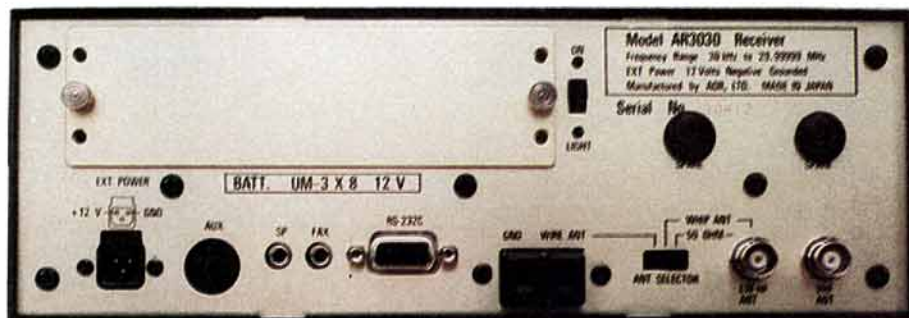
AR3030 rear panel.

A conventional analogue S meter is fitted and a backlit LCD panel which indicates frequency to 10Hz resolution, memory number and various status indicators. The S-meter and LCD illumination may be turned off via a rear panel switch to save current when powered from internal batteries.