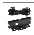
Control head separation kit EDS-30