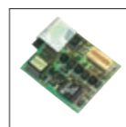
Digital modulation unit EJ-47U