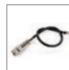
8-pin microphone adapter EDS-8