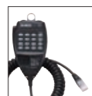
DTMF Microphone EMS-79