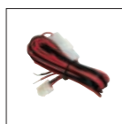
DC cable UA38Y UA-0038Y