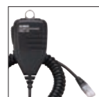
Plain Microphone (EMS78 or EMS79 depending on version) EMS-78