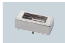
455 kHz FILTERS Have good shape factor and provide you with better reception.