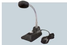
SM-6 DESKTOP MICROPHONE Electret condenser-type desktop microphone.