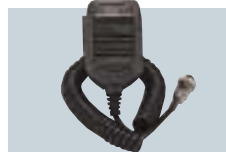
HM-36 HAND MICROPHONE Same as that supplied.