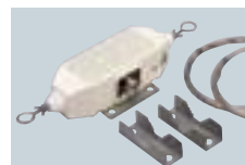
MN-100 ANTENNA MATCHER Match the transceiver to a dipole antenna without applying DC power. 8 m×2 antenna wires come attached.