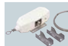
MN-100L ANTENNA MATCHER Match the transceiver to a long-wire antenna without applying DC power. 15 m×1 antenna wire comes attached.