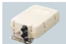
AH-4 AUTOMATIC ANTENNA TUNER Covers 3.5–30 MHz with a 7 m (23 ft) or longer wire antenna.