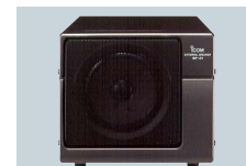
SP-21 EXTERNAL SPEAKER Input impedance: 8Ω Max. input power: 5W SP-20 EXTERNAL SPEAKER is also available.

Les spécifications et informations données dans ce document peuvent être modifiées sans préavis.