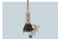
AH-2b ANTENNA ELEMENT For mobile operation with the AH-4. All bands between 7–30 MHz can be matched.