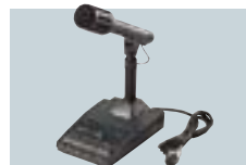
SM-20 DESKTOP MICROPHONE High quality desktop microphone. Includes.[UP]/[DOWN] switches and low cut function.