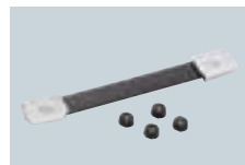
MB-23 CARRYING HANDLE For easy portability.