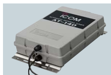
AT-140 HF AUTOMATIC ANTENNA TUNER Covers 1.6–30 MHz with a 7 m (23 ft) or longer wire antenna. AT-130/E is also available.