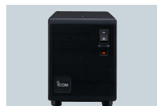
PS-125 DC POWER SUPPLY Compact power supply with high current capability. Output: 13.8 V DC (25 A max.)