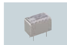
CR-338 HIGH STABILITY CRYSTAL UNIT Contains a temp. compensating heater for improved frequency stability. Frequency stability: ±0.5 ppm