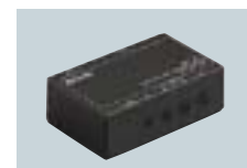
CT-17 CI-V LEVEL CONVERTER For remote transceiver control from a PC equipped with an RS-232C port.