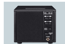
SP-23 EXTERNAL SPEAKER 4 audio filters; headphone jack. Input impedance: 8Ω Max. input power: 5W (Not available for EU countries)