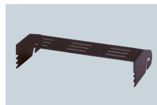
IC-MB5 MOBILE BRACKET For installing the transceiver under a table, in a vehicle, etc.