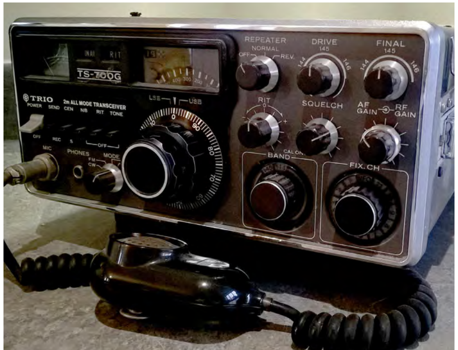
Fig. 2: The TS-700 from the front.

In my first job in Cambridge, my first car, a Ford Capri 1600GT XLR (remember those?), with my TS-700 on the seat, was stolen from my work's car park one lunchtime. Two youths (I still have their full names and addresses in my memory but won't name them in print because I don't know whether the Rehabilitation of Offenders Act is valid from then) were caught with the car parked up and with both of them inside, just down the road from the main Cambridge police station (idiots!). My TS-700 had a Dyno-tape label (remember those also?) with my then callsign, G81YA, stuck onto the front, and it was still monitoring the local repeater GB3PI in Barkway, Hertfordshire. After a break following a QSO, the arresting police officer took the microphone and called, "G Eighty One YA, G Eighty One YA, this is Cambridge Mobile Panda 21 calling". My friend Mark G8FRL (who knew my car had been stolen) replied on air, countywide to all listening, to say that I wasn't on the air at that moment. The officer answered via the GB3PI repeater to say that, "Yes, his car has been stolen but we've recovered it and apprehended the two people inside it. We're taking the car back to the central police compound". "OK, I'll let him know, thank you", replied Mark. I recovered my