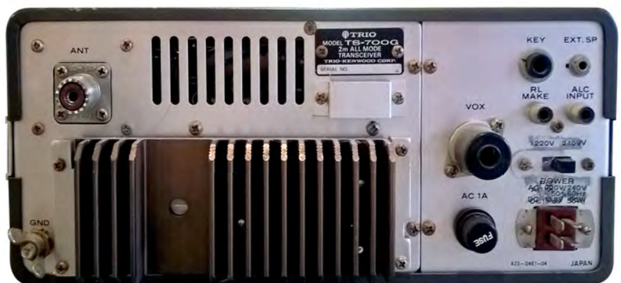
Fig. 3: Rear panel view.

car that evening, with my grateful thanks to the Cambridge police. The two youths each received custodial one-year plus committal borstal sentences after also admitting 12 other earlier TWOC (Taking Without Owner's Consent) offences. Apparently, the police had been after them for some time.