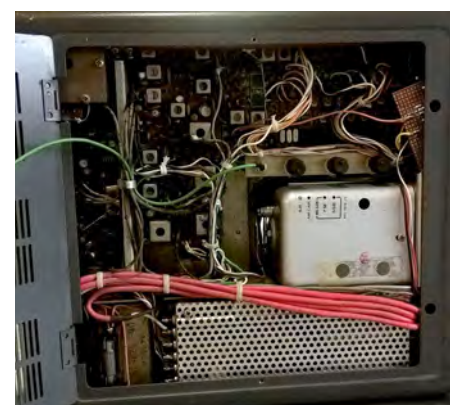
Fig. 4: A look inside.

I'll be back next month with a further bi-monthly Emerging Technology column with lots of new information, and the following