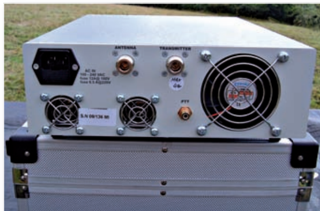
As you can see from this shot, the PSU has its own dual fans to ventilate hot air when running. The larger fan to the right is for the p.a. stage ventilation. Signals in and out of the amplifier, go via good quality N-type sockets.

Therefore you can only effectively use this dual-band amplifier on one band at a time. And then when wanting to move to the other band, you'll have to unplug both the drive connection and antenna connection and re-plug them up to another transceiver and antenna. It would be nice for dual-band amplifiers to have dual inputs and dual outputs!