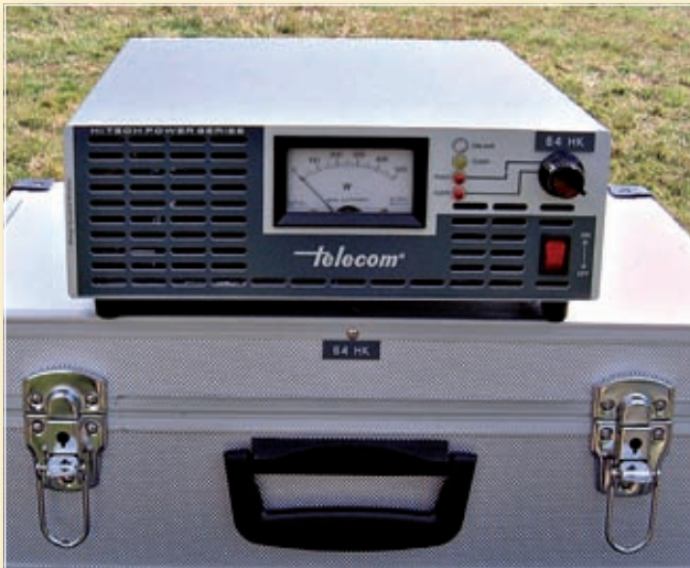
Sitting on top of its padded interior smart aluminium carry case, that's used to transport the Telecom 64-HK 50–70MHz dual-band linear amplifier.

Company: Waters & Stanton PLC (UK importers)