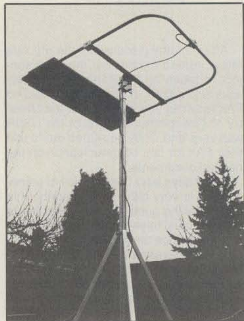
The AEA IsoLoop ® antenna can be mounted on a small TV-type tower. It is quite small (about 3 feet square) and can be used horizontally or vertically.

I was perspiring heavily after climbing down from the hot rooftop. My wife, Jean