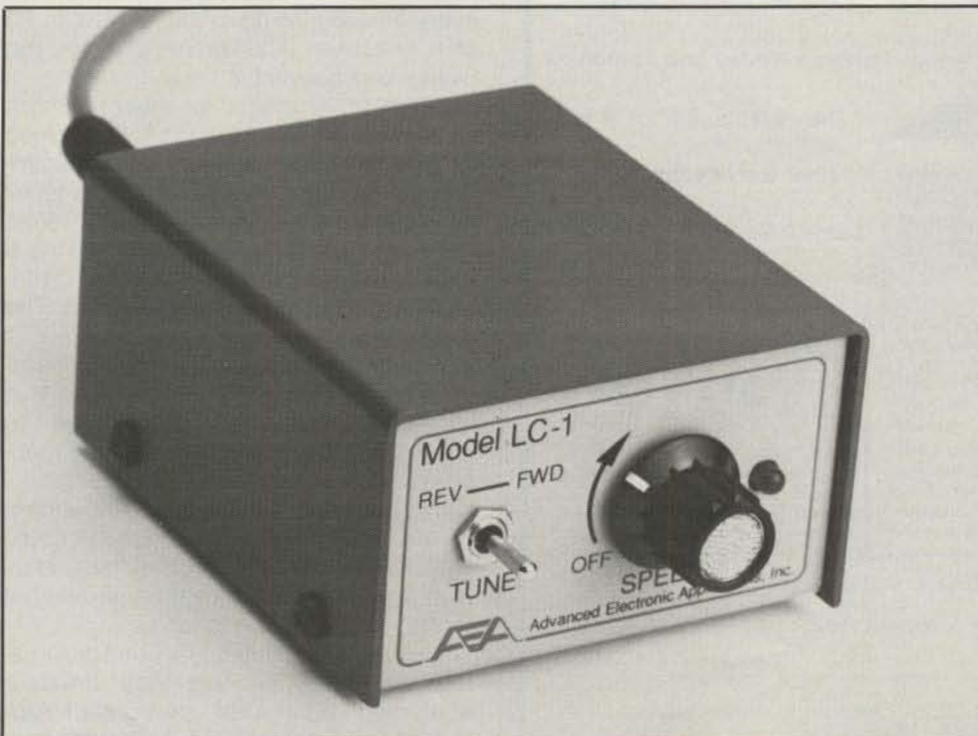
The LC-1 control box is fed with four-conductor shielded cable. It has two basic controls. One is for rotation direction, and the other governs the tuning speed.

I reached for the IsoLoop®'s control box, moved the tuning "speed control" to "fast," and pressed the motor control to the right. Six or eight seconds passed, and suddenly the S-meter seemed to