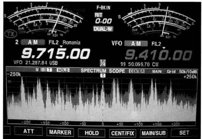
Photo E—A snapshot of the 31-meter shortwave broadcast band. The frequency range displayed is 9.465 to 9.965 MHz. Plenty of strong signals to listen to here!

system, I highly suggest your doing so. This antenna is not designed to replace a Yagi or any other full-size antenna, but rather is intended to assist a specific segment of the amateur market that is forced to manage with antenna or space restrictions. If you are a ham or SWL and live on a small lot or in an antenna-restricted area, or if you just prefer to operate incognito, without a question you will be forced to make significant compromises. I found the CHA250B to be an excellent choice for these circumstances. While we don't recommend violating any rules governing your QTH, one person can effortlessly raise the antenna at night when no one can spot it and take it down before daybreak. This antenna is also a great choice for