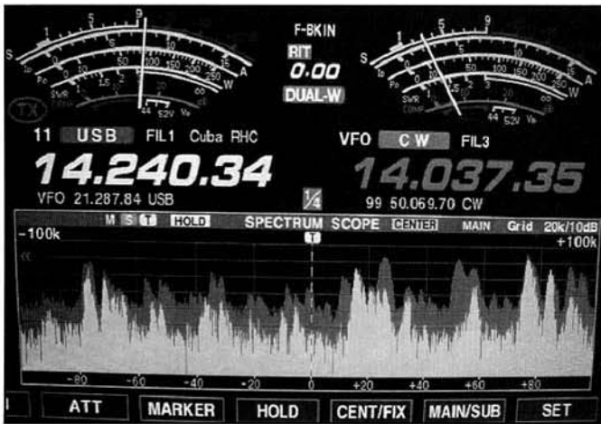
Photo D—A snapshot of the IC-7800 spectrum scope while on 20 meters with the CHA250B. The frequency range displayed is 14.140 to 14.340 MHz. Notice the large number of strong signals across the band.