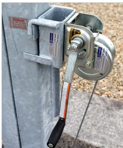
DW1000 Winch mounted on ACC2BPLA column. This bracket type for ACC/ACT columns and towers.

The photographs below show the three sizes of winch that we supply and also the three bracket mounting types.