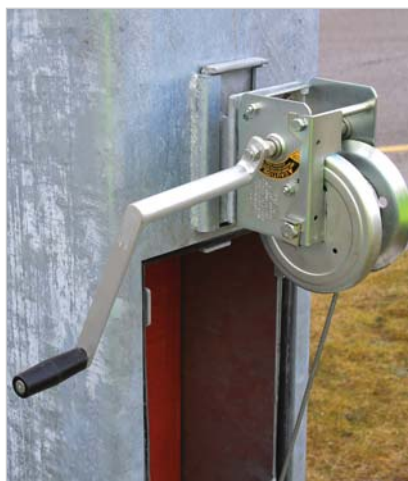
DW1500 Winch mounted on AW1545/TD pole. This bracket type for tubular poles.