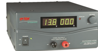
SPS-8400 3-15V 40A MAX see page 31