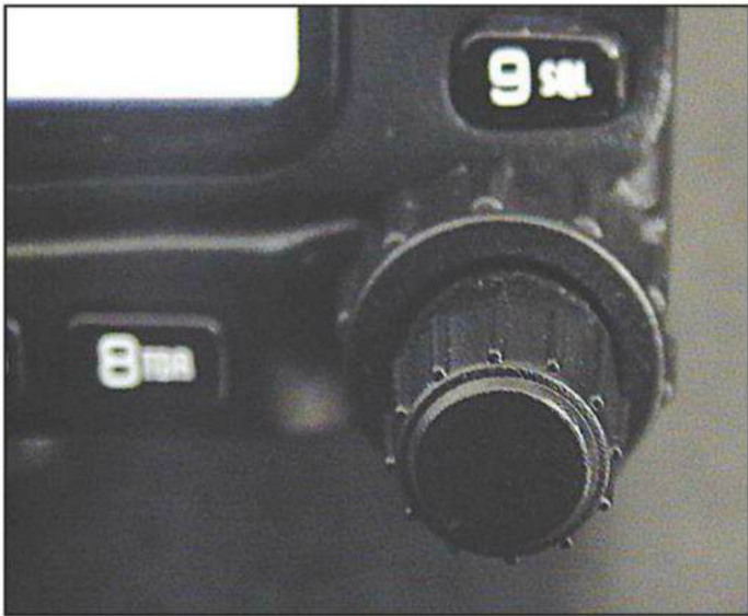
Photo C— The volume controls for the two receivers are nested on a single knob, sometimes making quick adjustments difficult. The company says it has improved the design.

operating systems, it can operate as a cross-band repeater, including separate CTCSS tones for each band. This will help minimize its own transmitter from activating the receiver circuit during transmit, with different CTCSS tones for each side of this unique dual band radio.