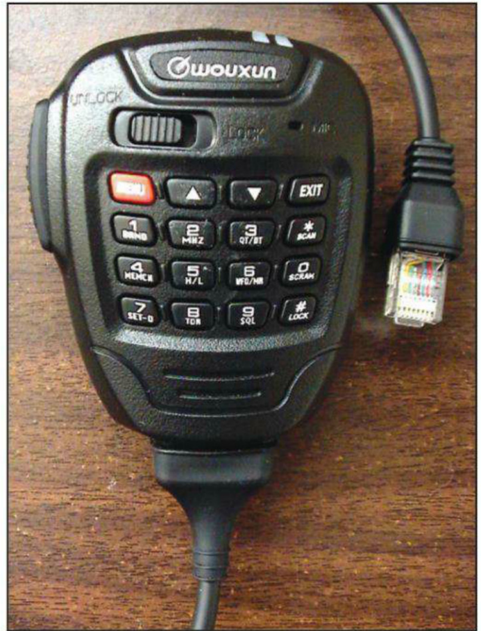
Photo D— The keys on the speaker mic are backlit and easy to use for simple programming of simplex channels. However, any more-complex programming should be done by computer. Also, the speaker is on the back of the mic, rather than in front, as is more common.

MENU 22 may allow you to name a specific channel frequency. This could work well for business radio use, but I