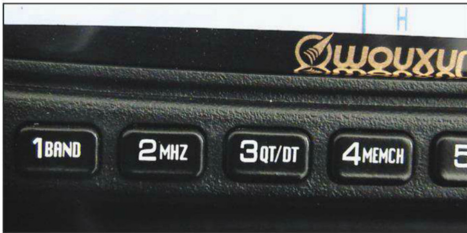
Photo E- The buttons are small, but have been improved to give the feel that they have indeed been pushed!