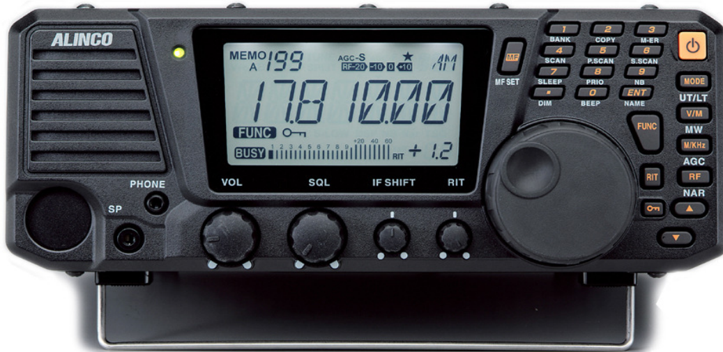
The front panel of the DX-R8T

this is it. The owner's manual is quite well written and contains many step-by-step instructions on how to tune the receiver, set its parameters, and store your favourite stations (including receive parameters) in any one of the 600 available memory channels. By consulting the owner's manual frequently you will soon become an expert at operating this receiver as its operation is really quite straightforward.