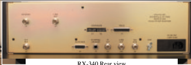
RX-340 Rear view