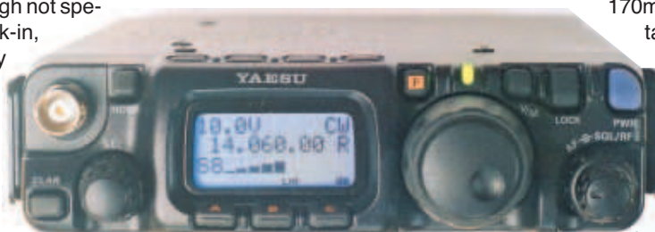
The display can be set to blue or amber

A Digital Code Squelch (DCS) system is also built-in. This uses one of 104 selectable codes to implement a squelch controlled link and is more robust and less prone to false triggering than CTCSS. A Code Search feature allows the DCS code transmitted by a received station to be detected and stored.