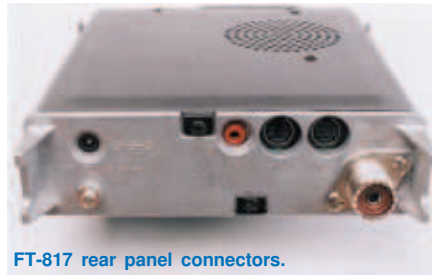
FT-817 rear panel connectors.

VOX is provided, functioning on all voice modes, but there is no speech processor. A semi break-in system is included for CW with recovery delay times separately adjustable for CW and VOX. Although not specifically designed for full break-in, the minimum recovery delay time of 10ms effectively emulates QSK operation. A built-in CW electronic keyer is adjustable in speed over the range 4 - 60WPM and has adjustable dot:dash weighting but does not include any memo-