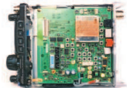
Under the top cover of the FT-817.

Despite its compact size, the FT-817 provides comprehensive memory features. 200 regular memories are included which may be partitioned into 10 groups of 20 channels and each channel may have an eight-character alphanumeric label attached for easy identification. A one-touch quick