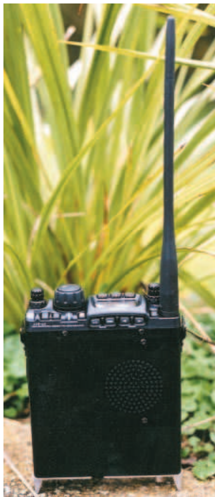
The FT-817 with supplied YHA-63 antenna.

for easy use and the finger detent ineffective for adult fingers, but this is the price which must be paid for a radio of this compact size. Also I found the tuning knob very easy to knock and move frequency, but there is a lock button to prevent this. The control ergonomics for most functions are quite cleverly arranged and easily mastered after a brief learning period. I would have preferred the