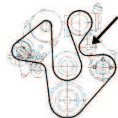
Discovery Series II NON-ACE Belt Routing