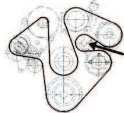
Discovery Series II ACE-equipped Belt Routing