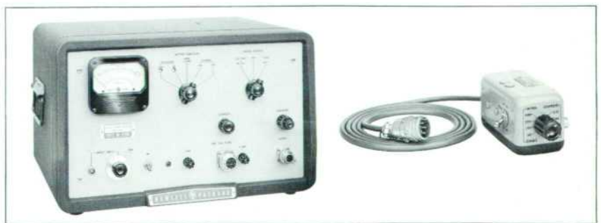
Fig. 5. -hp- Model 340B NFM and Model 345B I-F Noise Source (right) can be used with any two specified i-f's between 10 and 60 megacycles. Model 345 Source has selectable output impedances to match common i-f inputs between 50 and 400 ohms.

where \alpha T_{\text{excess}} is the effective excess noise ratio of the noise source, as seen at the receiver input. For the -hp- argon noise sources, T_{\text{excess}} has the value 33.1T_0 . Using a 20 db directional coupler ( \alpha = 0.01 ) and the -hp- argon noise