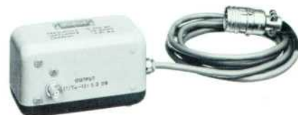
Fig. 2 (above). New Model 343A diode type VHF Noise Source provides flat noise output up to 600 megacycles without tuning for convenient testing of 50-ohm input receivers. Internal matching network compensates for transit-time effects in diode.