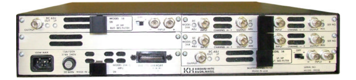
Figure 2.2 Rear Panel of Model 3905C