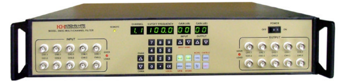
Figure 2.1 Model 3905C Front Panel Controls

Figure 2.1 shows all the front panel controls and displays of the Model 3905C.