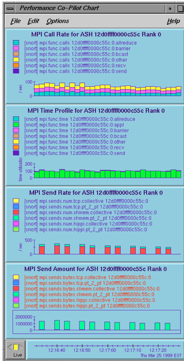
Figure 6-2 mpimon Tool