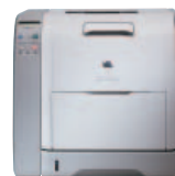
HP Color LaserJet printers