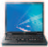
HP Compaq Business Notebook 6100 series with Intel® Centrino™ Mobile Technology.