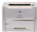
HP LaserJet printers