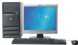
HP Compaq Business Desktop dx2000 feature the most powerful Intel® Processors.

Buy today from the #1 vendor 1 in Notebooks and Desktops for your business.