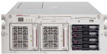
Compaq ProLiant DL580