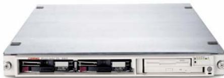
Compaq ProLiant DL360

1 x 1.2GHz CPU, 512Kb L2 cache 1GB main memory