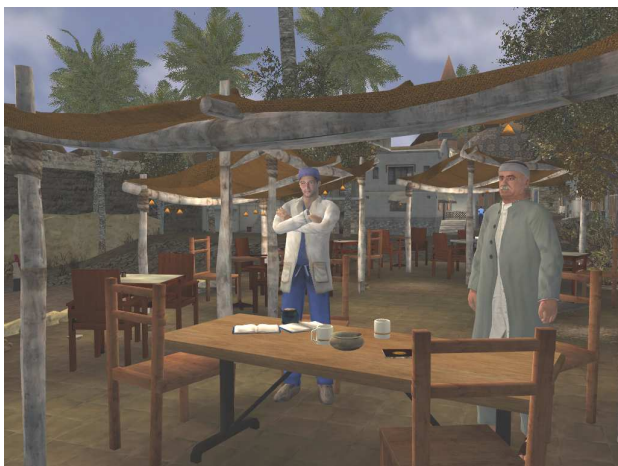
Figure 1: SASO-EN Scenario

In the course of the interaction, the human trainee must negotiate with the virtual characters, establishing trust and satisfying the objections of the doctor and elder to moving the clinic. The virtual humans evaluate the utterances made by the trainee and each other, update their models of the conversational states and models of each other, and plan how to react and what to do next.