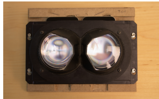
Figure 1: Experimental head mounted display with lenses in place.

Even though HMDs have not been able to enjoy the same economies of scale as graphics cards, we have identified a different set of trends to leverage: the rise of smartphone graphics power, coupled with growing display resolution. These devices can provide a large portion of the components required for HMDs. To demonstrate this, we have integrated a lens assembly, game engine, and head tracking with two smartphones, creating an experimental commodity head mounted display. This HMD is unique in that it renders imagery onboard and is battery powered, allowing a truly untethered virtual reality experience.