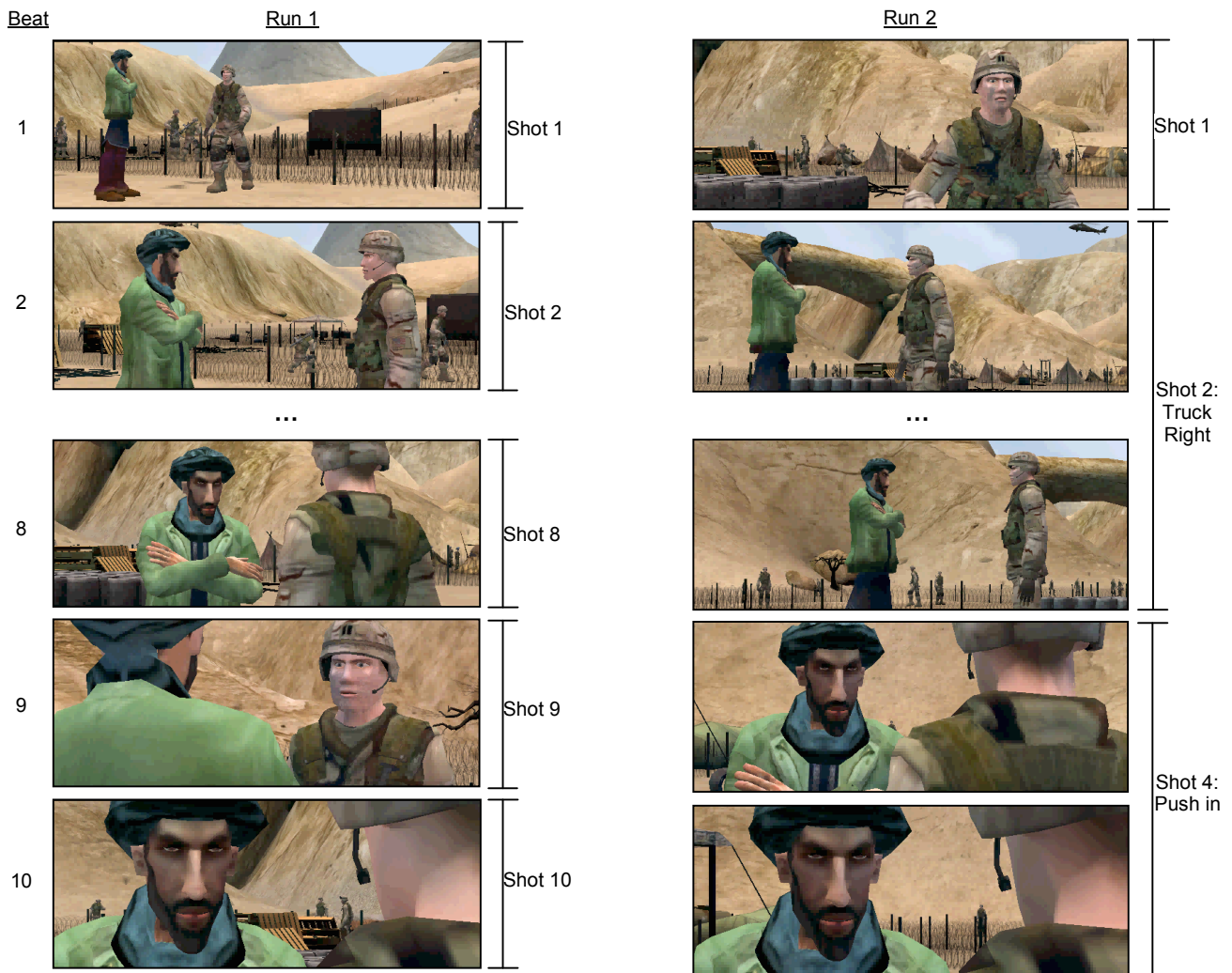
Figure 6. Cambot screenshots: two runs of the same scene using different heuristics.

The next search phase considers each beat independently. Cambot compiles a list of all the shots that are compatible with the previously selected stage and blocking. It evaluates the shots according to the given view constraints. Cambot uses dynamic programming to search for the sequence of shots (i.e., the reel) that best covers the beats in a scene. This technique reduces an exponential search space of shots – given n beats and m shots available, there are m^n possible scenes – to polynomial time, O(mn) . This assumes that the property of optimal substructure holds for reel selection: that the optimal solution to a large problem contains within it the optimal solutions to the smaller sub-problems on which it is built.