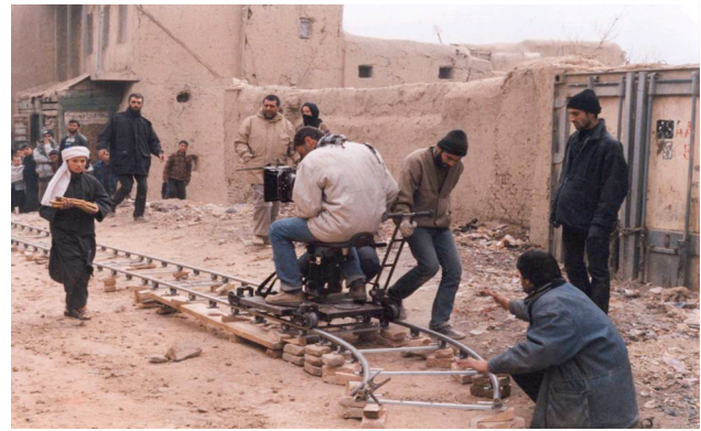
Figure 2. The capturing of a cinematic shot requires coordination between actor and camera placement.

For example, Figure 2 shows a set during the filming of a shot; in this case, the movements of the camera and the character are closely coordinated so that the former leads the latter down the street. In order to achieve this shot, it was necessary for the director to select a location with sufficient space for the actor and camera to move, and to